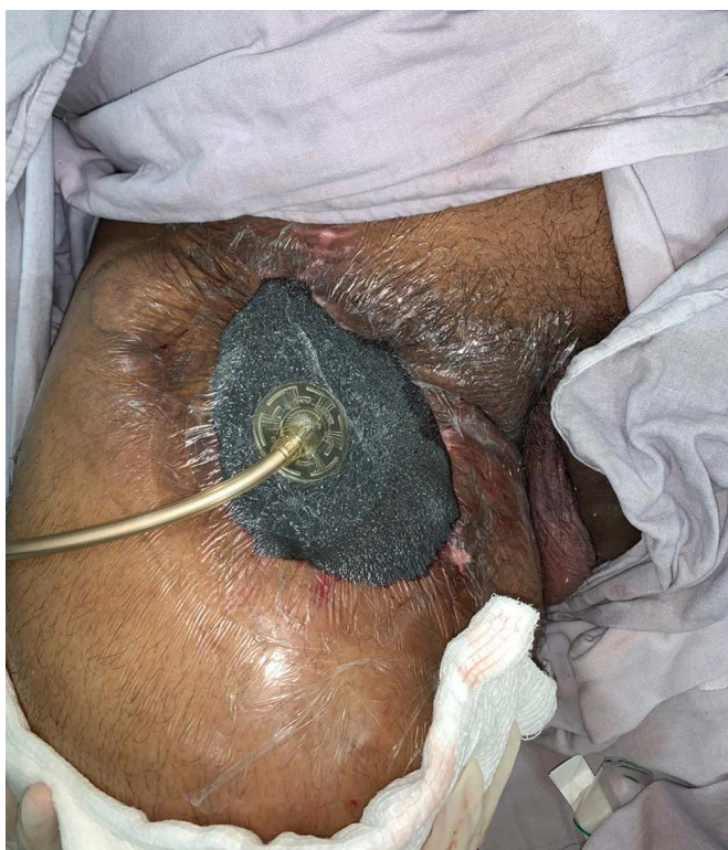
Figure 2. Application of negative pressure therapy on the wound.