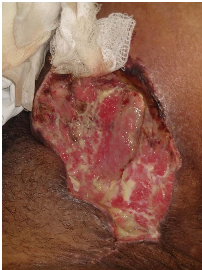
Figure 1. Wound in the right inguinal region with sloughs and areas with granulation tissue.

After three days, the patient developed a febrile peak, tachycardia, and tachypnea, progressing to severe acute respiratory syndrome (SARS) and the need for intensive care. After transfer to the intensive care unit (ICU), orotracheal intubation was performed, and the patient was in respiratory and contact isolation, according to the HCFMRP-USP protocol during the Covid-19 pandemic. Chest X-ray performed on the bed showed an infiltrate bilateral interstitial (Figura 3). According to the SAPS 3 system, the calculation of the probability of death upon admission to the ICU was 90.98% 7 .