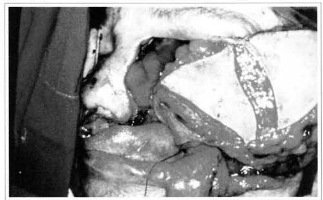
Fig. 3. Intraoperative aspect. Tridimensional extensive defect where intra-oral, lateral nasal wall and orbital-zygomatic region reconstruction were necessary. Deepithelization of the flap areas, which are necessary to the flap shaping, are observed.