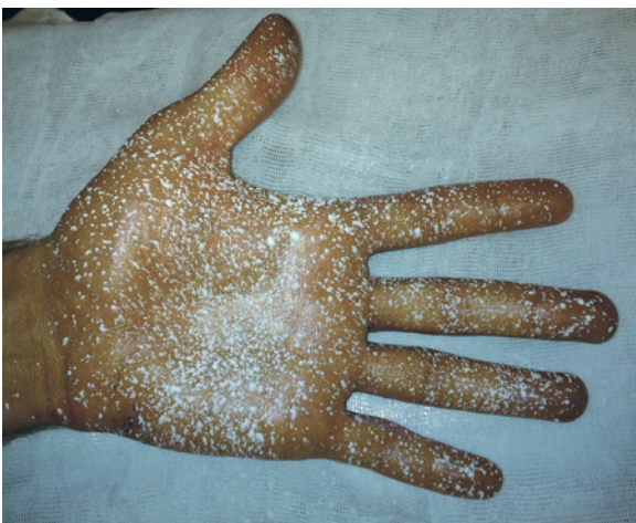
Figure 5 – Result of palmar hyperhidrosis control eight days after botulinum toxin injections.