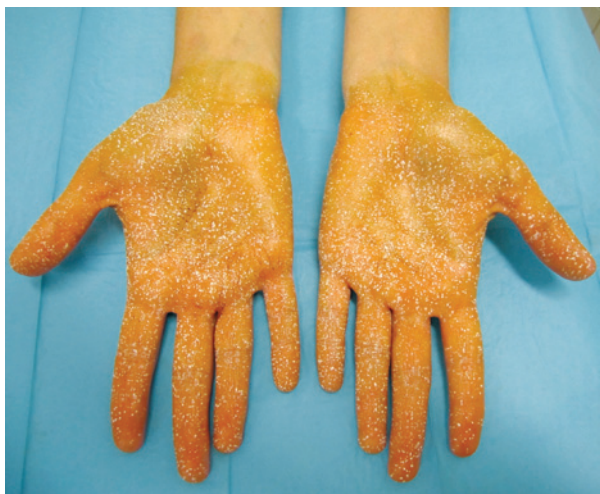
Figure 9 – Result evidencing improvement in hyperhidrosis 8 months after the intradermal injection of type A botulinum toxin.