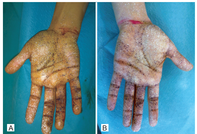
Figure 7 – Minor test prior to the performance of regional anesthetic block and administration of intradermal injections of botulinum toxin.