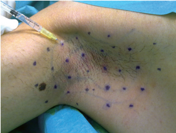
Figure 3 – Equidistant points, 1 cm to 2 cm from each other; in the axillary region for intradermal injections of type A botulinum toxin.