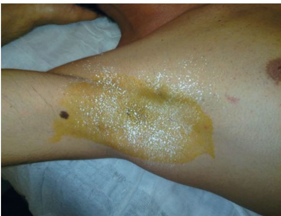
Figure 4 – Result of axillary hyperhidrosis control eight days after botulinum toxin injections.