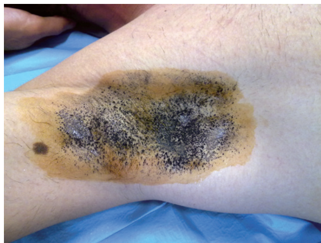
Figure 1 – Minor test for right axillary hyperhidrosis.

Only 2 (6.7%) patients had ecchymosis at some injection points and bilateral paresthesia of the hands and fingers associated with neuropathic pain and reduction in the force of intrinsic movements of the hand. There was no evidence of vascular deficit of the hands and fingers. Oral ibuprofen (600 mg every 12 hours) and physiotherapy sessions were prescribed. Muscle strength returned to normal within 72 hours, and the other symptoms had completely receded by the second week. No cases of compensatory hyperhidrosis or mortality were observed.