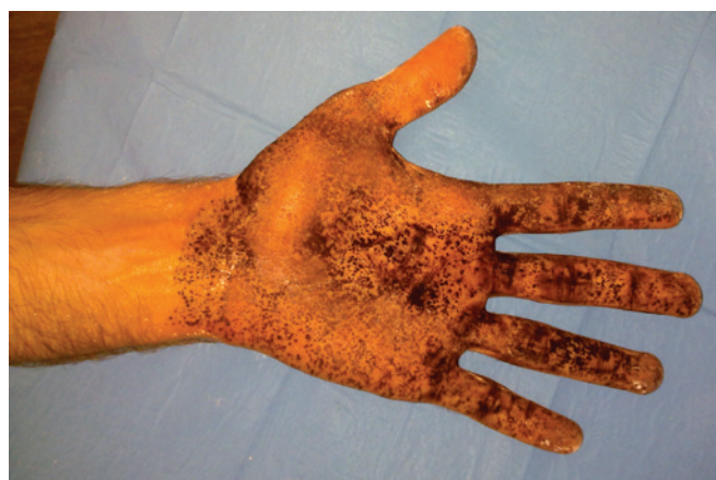
Figure 2 – Minor test for left palmar hyperhidrosis.