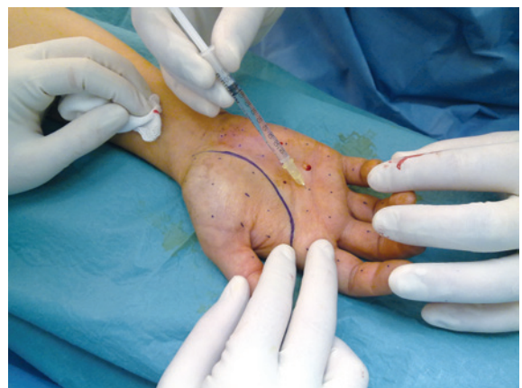
Figure 8 – Intra-dermal injections in the palmar region after regional anesthetic block in the fist.