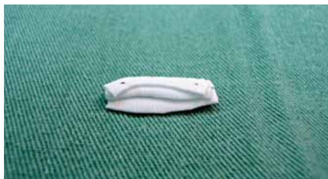
Figure 1 – Polytetrafluoroethylene prepared for implant.

For assessment of results, a table was created with scores from 0 to 5, according to the aesthetic improvement