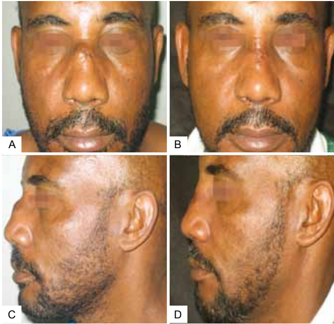
Figure 4 – In A , preoperative period of post trauma rhinoplasty with the use of polytetrafluoroethylene (PTFE) in the nasal dorsum, front view. In B , postoperative period of post trauma rhinoplasty with the use of PTFE in the nasal dorsum, front view. In C , preoperative period of post trauma rhinoplasty with the use of PTFE in the nasal dorsum, left lateral view. In D , postoperative period of post trauma rhinoplasty with the use of PTFE in the nasal dorsum, left lateral view.