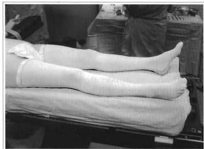
Fig. 3 –Elastic stockings with graded pressure.