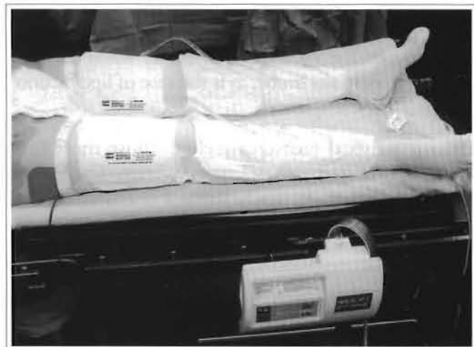
Fig. 2 – Pneumatic compression device for lower limbs.