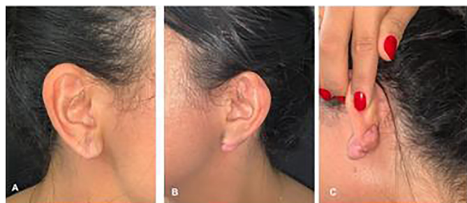
Figure 5. A: Right ear without recurrence. B and C: Recurrence of keloid in the left ear after 2 years of treatment.

CI: Confidence interval; RE: Right ear; LE: Left ear; RR: Relative risk.