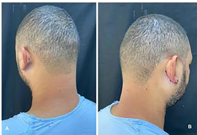
Figure 3. A: Post-operative keloid in the left ear. B: Keloid in the right ear.

All excised lesions were sent for pathological study (Figure 4).