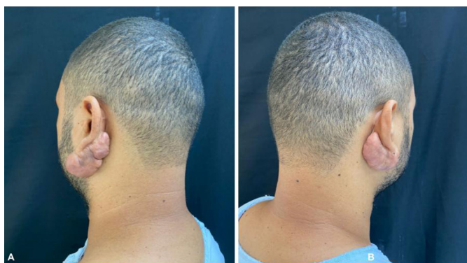
Figure 1. A: Preoperative keloid in the left ear. B: Keloid in the right ear.

Figures 1, 2, and 3 show pre-, intra- and postoperative images according to the surgical protocol. Scars were evaluated postoperatively over 12 months by the primary surgeon and assistant surgeon. Their appearance was assessed and whether there was a recurrence of keloids in any lesion. In case of recurrence, the patient could be subjected to new treatment according to personal decision.