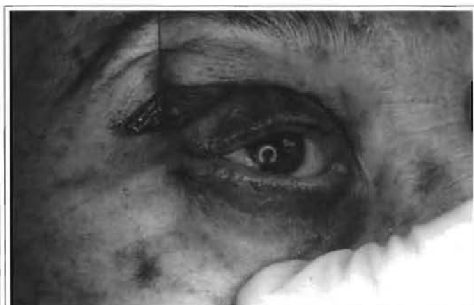
Fig. 6 - Traction of the lower eyelid after canthopexy suture and checking resistance.