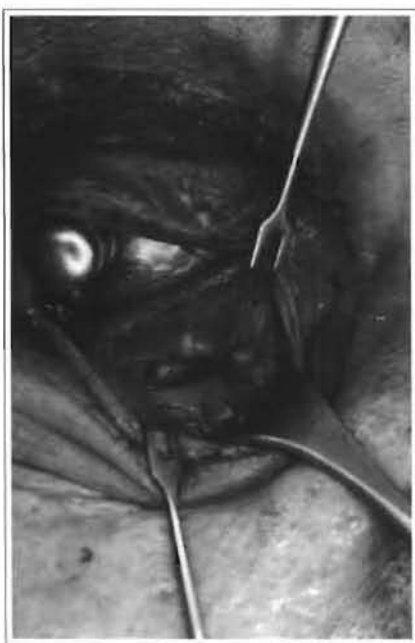
Fig. 9 – Suture of lower lid pads around the lower orbit, medially.