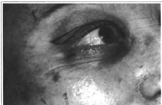
Fig. 4 - Drawing of the excess skin of the upper eyelid and lower eyelash incision to perform canthopexy.