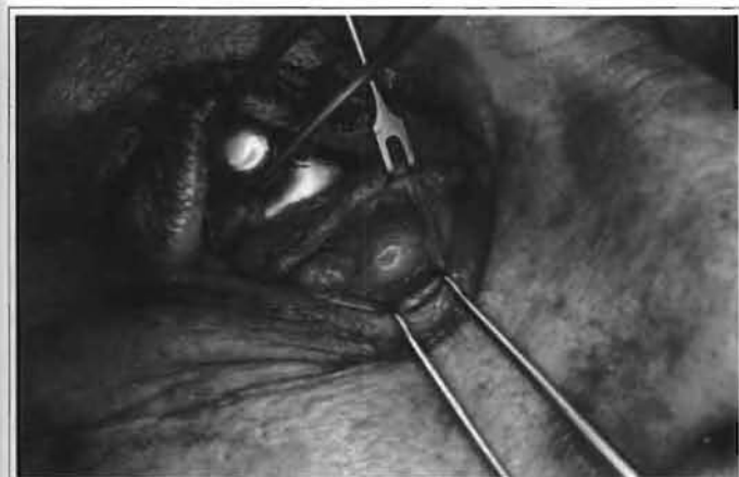
Fig. 3 - Exposure of eyelid pads after cutting the lower oblique muscle.