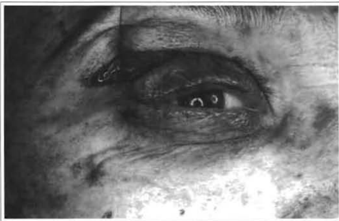
Fig. 7 – Presence of fine wrinkles after lower transconjunctival blepharoplasty and canthopexy.