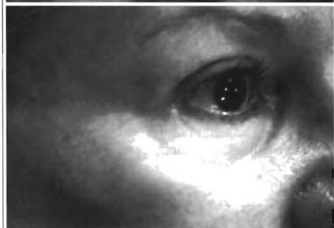
Figs. 10, 12 and 14 – Female, 56 year-old patient, skin phototype II of the Fitzpatrick classification, presenting Glogau Classification, type IV, wrinkles and upper and lower lid pads, with a depression at the level of the lower orbital margin.