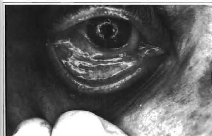
Fig. 5 - Traction movement of the lower eyelid in order to measure lower eyelid flaccidity.