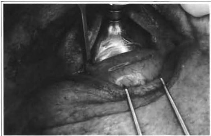
Fig. 2 - Transconjunctival incision approximately 9 mm from the eyelash border, or at the proximal third of the conjunctival sac.