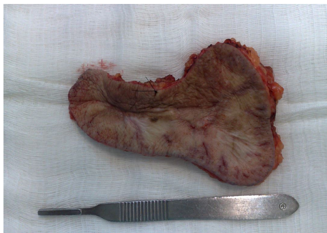
Figure 2. A surgical specimen sent for pathological examination.