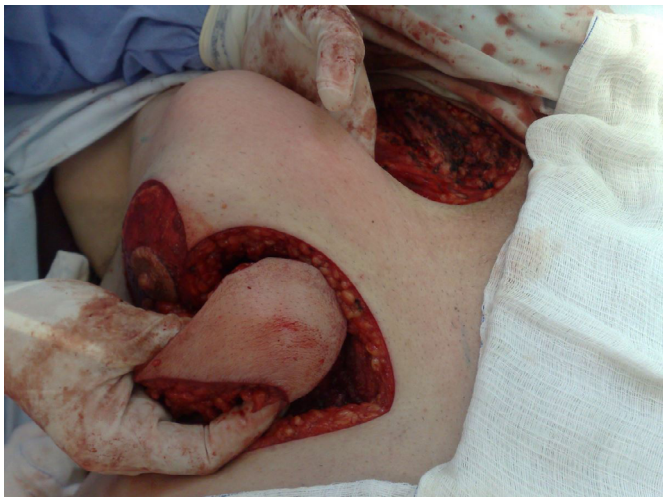
Figure 4. Myocutaneous island flap of the pectoralis major muscle.

The skin island of the myocutaneous flap corresponded to the medial triangular area of the breast that would normally be resected and discarded in a reduction mammoplasty (Figure 4).