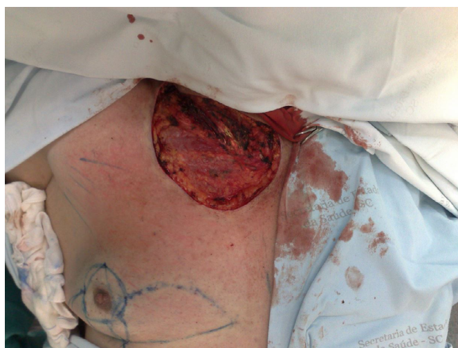
Figure 3. Extensive surgical wound resulting from wide resection of the tumor.