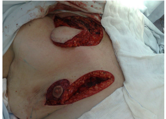
Figure 5. Transposition of the pectoral flap.

After the small rise of the nipple-areola complex (NAC), the male breast is sutured in layers. A lateral triangle of skin and fat was resected to adjust the inverted T mammoplasty scar 11,12 . In the detachment area, a 4.8 suction drain was left (Figure 6) 13 .