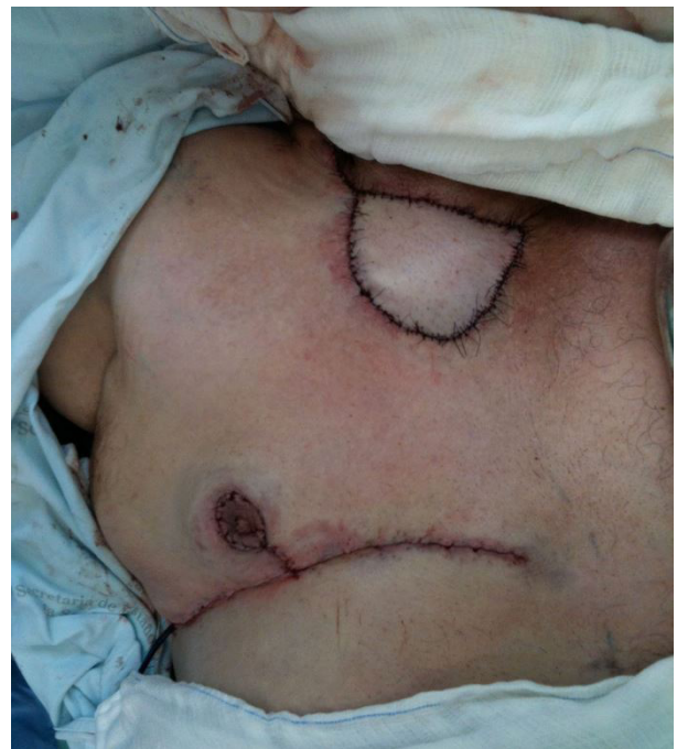
Figure 6. Final aspect of mammoplasty and reconstruction of the pectoral defect.

Postoperatively, the drain was removed after 7 days and there were no complications 13 . The pathological examination confirmed the diagnosis of infiltrative basal cell carcinoma and surgical margins free of neoplasia. The patient underwent outpatient follow-up and did not experience any further tumor recurrence (Figure 7).