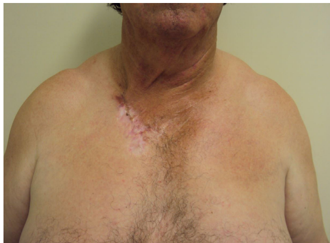
Figure 1. Extensive infiltrative and recurrent basal cell carcinoma in the parasternal region on the right.

The marking of the tumor piece to be resected was carried out with lateral safety margins of 2.0cm (Figure 2). The resulting wound exposed the medial portion of the right clavicle and the ipsilateral pectoralis major muscle (Figure 3).