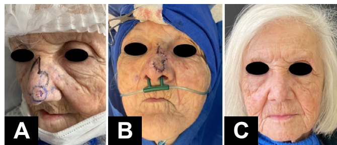
Figure 1. Case 1 - Squamous cell carcinoma in situ on the left nasal tip measuring 4mm. A) Surgical demarcation of the tumor with a 4mm lateral margin and the flap; B) Bilobed flap prepared; C) Late postoperative period of 1 year.