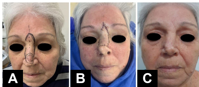
Figure 2. Case 3 - Nodular basal cell carcinoma located at the transition between the dorsum and nasal tip, measuring 1.0cm. A) Surgical demarcation of the tumor with a 4mm lateral margin and the frontonasal flap; B) Frontonasal Marchac flap positioned, leading to deviation of the nasal tip; C) Late postoperative period of one year.