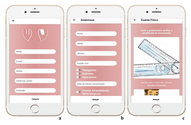
Figure 2. Examples of screens from the Linfedema APP application. Screens for (a) user registration, (b) completion of anamnesis, and (c) physical examination.

The application consists of 31 screens, 4 pictures, and 3 videos. The initial screen contains "Enter " icons for registered users or "Register" for new ones. When completing the registration (Figure 2a), the user will open the anamnesis screen by clicking "Next" (Figure 2b). After completing the anamnesis, the user will be directed to the physical examination screen (Figure 2c), where he can assess the range of motion with illustrations and instructions on performing the measurement technique.