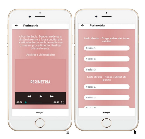
Figure 3. Examples of screens from the Linfedema APP application. (a) Demonstration video of the perimetry technique and (b) form for data collection.

The application was registered at the National Institute of Industrial Property (INPI) of the Ministry of Development, Industry, and Foreign Trade and is available on the Google Play Store under the name "Linfedema APP."