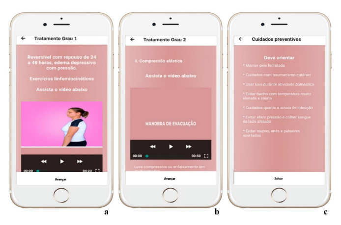
Figure 4. Examples of screens from the Linfedema APP application. Screens showing videos for (a) grade 1 treatment, (b) grade 2 treatment, and (c) preventive care indications for upper limb lymphedema.