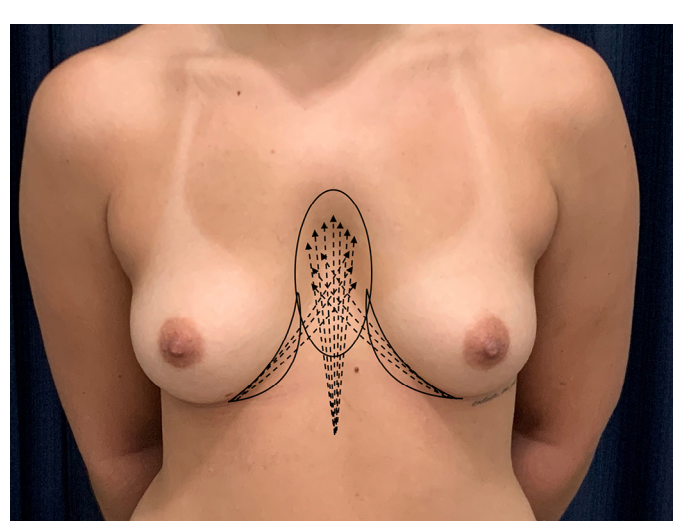
Figure 2. Schematic drawing of the operative access showing the different crossed paths of the 2mm cannula through the incision in the inframammary fold and anterior thorax to treat pectus excavatum .