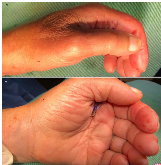
Figure 3. Immediate postoperative period. Clinical presentation in front and profile. Correction of the typical pathological attitude of these lesions is seen.