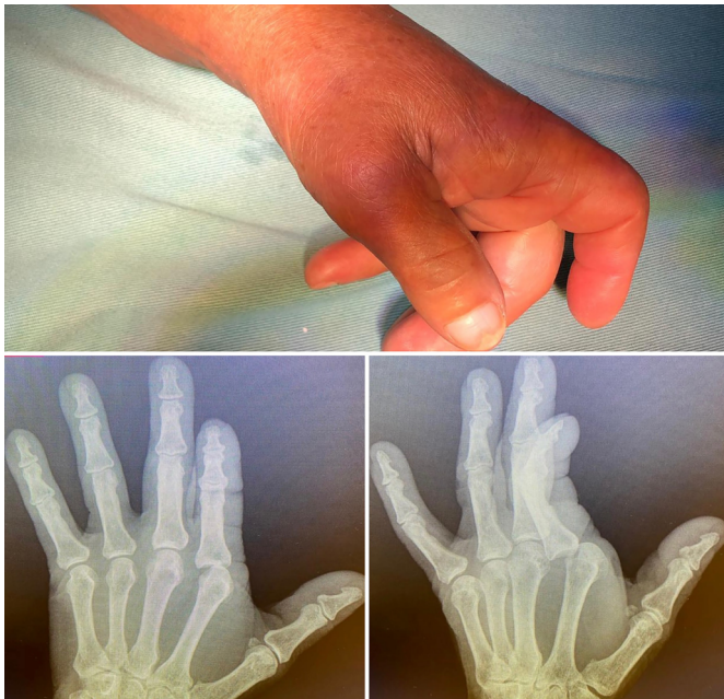
Figure 1. Clinical presentation in the emergency. A) Clinical presentation in the emergency room: metacarpophalangeal joint (MCP) hyperextended to 30° and slightly flexed interphalangeal joint. B and C) Plain radiographs: anteroposterior view showing ulnar displacement of the proximal phalanx and enlargement of the joint space. Oblique radiography confirms dorsal displacement of the proximal phalanx.

The energetic hyperextension determined a complex dorsal dislocation of the metacarpophalangeal joint of the second finger of the left hand, presenting in the emergency with a pathological attitude, with the MCP joint in 30° of extension and the interphalangeal joints slightly flexed, with the impossibility of joint mobilization of the second ray (Figure 1).