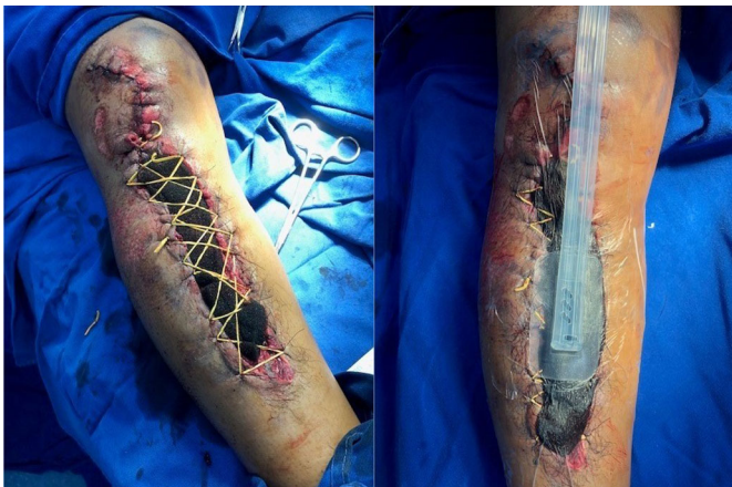
Figure 3. Production of an elastic suture in association with vacuum dressing in the right lower limb injury.