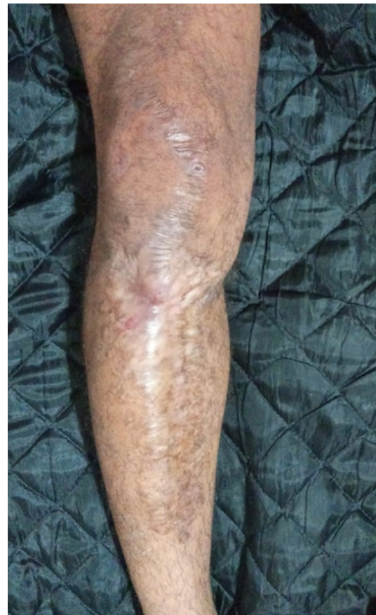
Figure 5. Final appearance after removal of elastic suture and primary suture of the lesion.