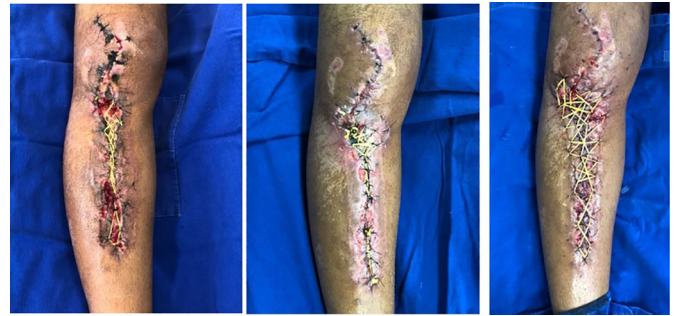
Figure 4. New confections of elastic sutures and vacuum dressing.