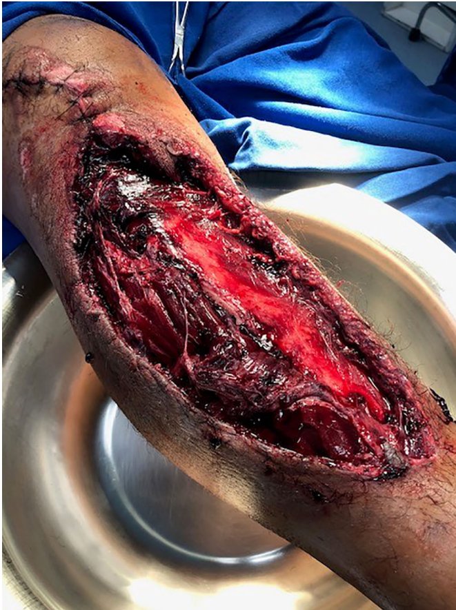
Figure 2. Right lower limb after debridement of the lesion.