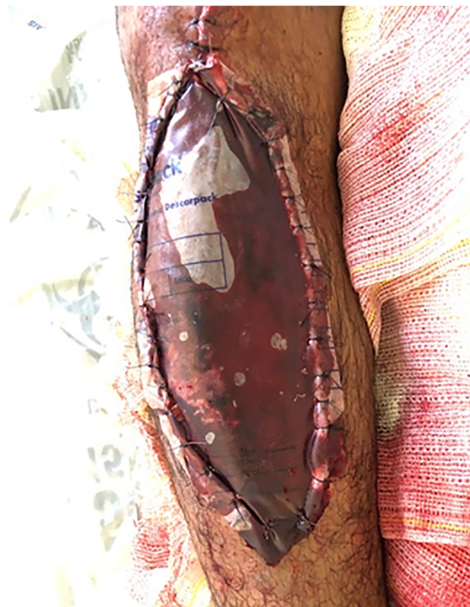
Figure 1. Right lower limb with suture for edge containment with plastic equipment.

the plastic surgery team. A large clot was identified, exhaustive washing was performed, and hemostasis was reviewed (Figure 2).