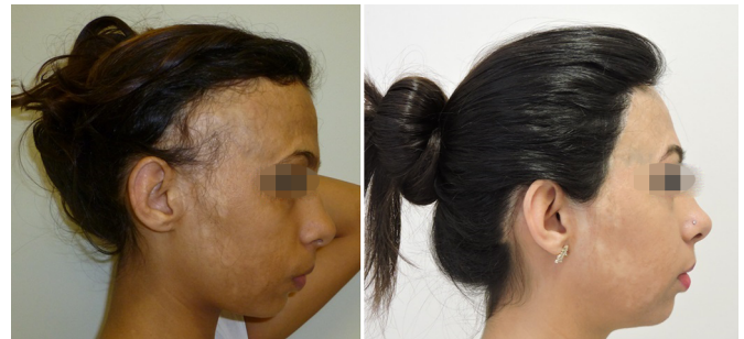
Figure 5. Pre and late postoperative.