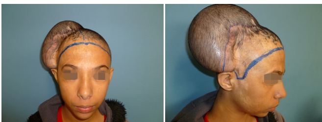
Figure 2. Post-operative implantation and implantation expansion.

In the second week after surgery, 20 ml was instilled weekly for ten weeks until the volume of 240 ml of the expander was reached (Figure 2). After maximum expansion, the patient underwent a new surgical procedure after ten weeks in which the expander was removed, and an advancement flap was made for the region with scarring alopecia (Figure 3). A trichophytic incision was made in the scalp to place the flap on the topography of the hair's cutlet and contour in the frontal-parietal region. The patient evolved well in the early and late postoperative periods without complications (Figures 4 and 5).