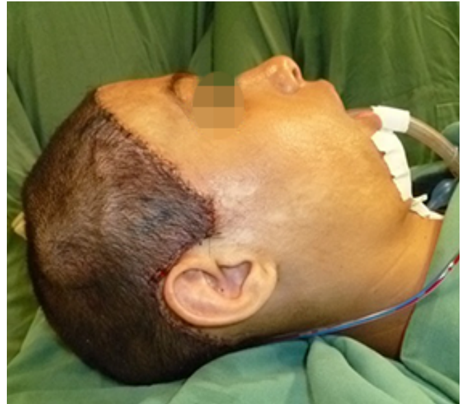
Figure 4. Immediate postoperative.

The current methodology was the retrospective analysis of the patient's medical record. This paper follows the standards of the Helsinki ethics committee and CEP approval.