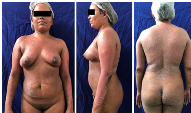
Figure 2. Patient on the day of hospital discharge.