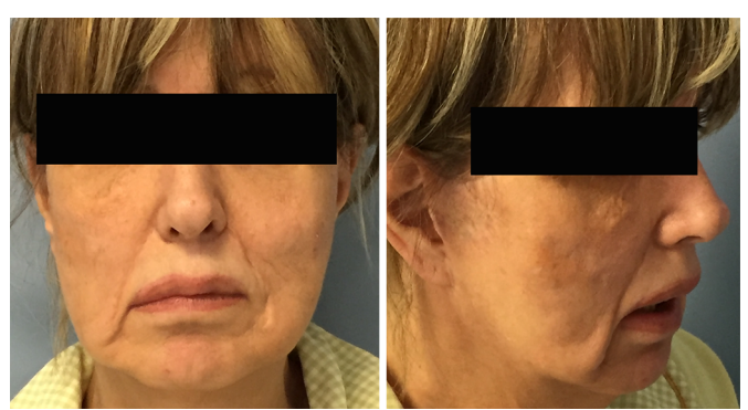
Figure 1. Patient presented with a right lower lip drop and evident bilateral cheek deformity.

On examination 2 years after primary surgery, she had a bilaterally elongated upper lip, a right lower lip drop with evident lip dynamic distortion when she smiled, and bilateral cheek deformity probably due to marginal mandibular nerve damage (Figure 1). Using a flexible ruler, the distances of the modiolus to the cupid's and commissure to the cupid's bow were 4.5 and 3.5 cm on the paralyzed side and 4 and 3 cm on the non-paralyzed side.