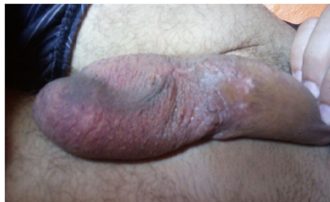
Figure 2. Result of resection with primary closure of the calcified nodules 6 months postoperatively.

The patient recovered well after surgery, without any complications. He had satisfactory aesthetic results (Figure 2), without any functional changes.