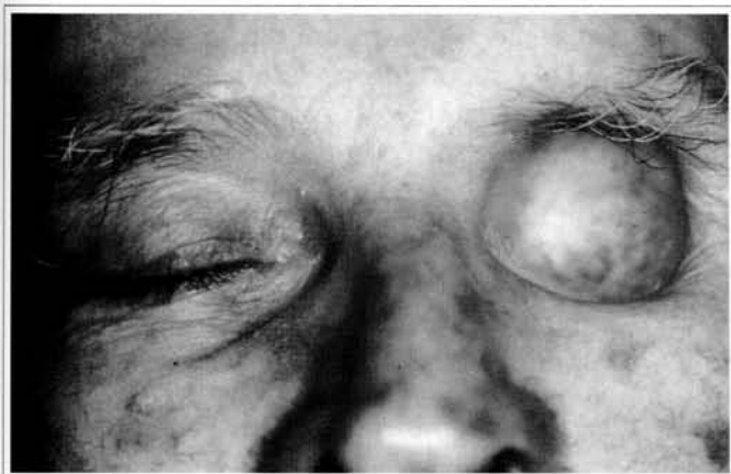
Fig. 1 - A 63-year-old patient with orbital deformity resulting from prickle cell carcinoma resection.

Fig. 1 - Apresenta um paciente de 63 anos com deformidade orbitária resultante da ressecção de carcinoma espinocelular.