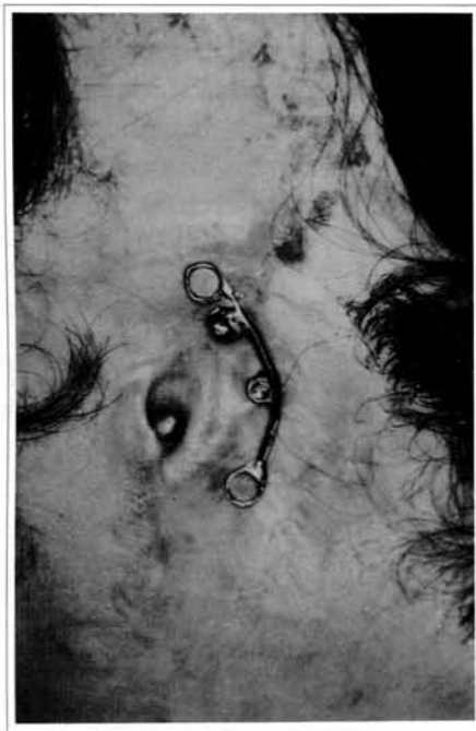
Fig. 8 - Metallic bar that supports the auricular prosthesis.