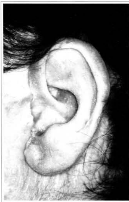
Fig. 9 - Detail of the auricular prosthesis.