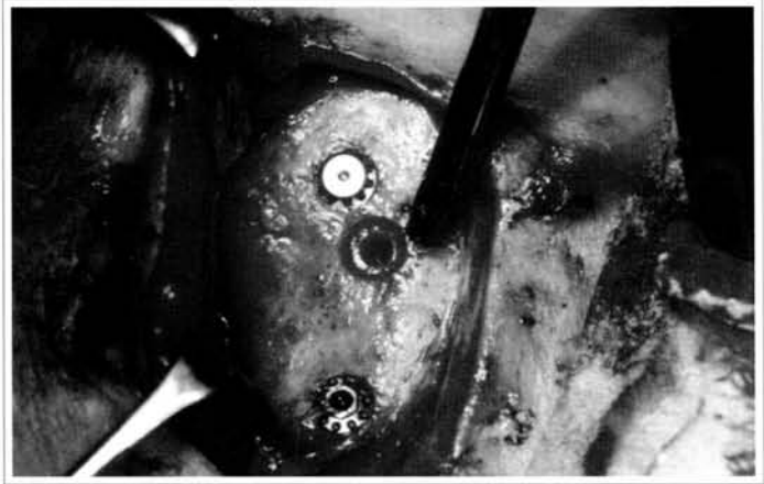
Fig. 7 - Three osseointegrated implants being inserted in the mastoid.