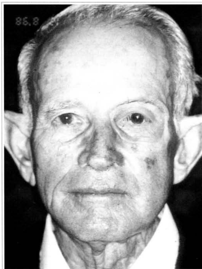
Fig. 5 - Final appearance of the prosthesis in place.

Fig. 3 - Identifica-se a armação metálica para retenção da prótese.