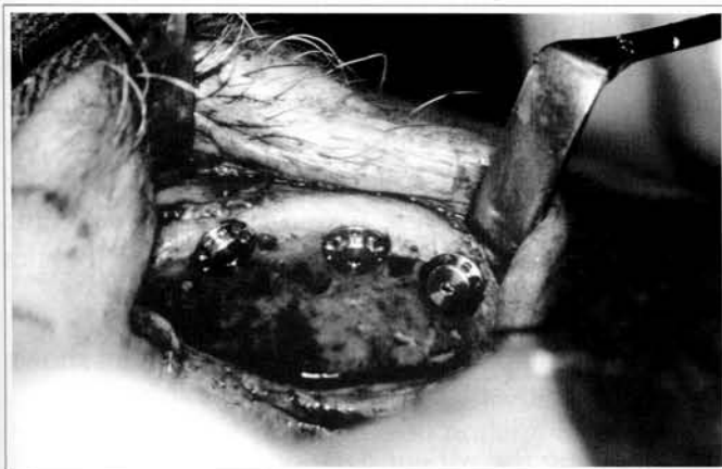
Fig. 2 - Three osseointegrated implants being inserted in the upper orbital margin (1 st step).

Fig. 4 - Apresenta-se a prótese orbitária confeccionada com coloração intrínseca e extrínseca definidas.