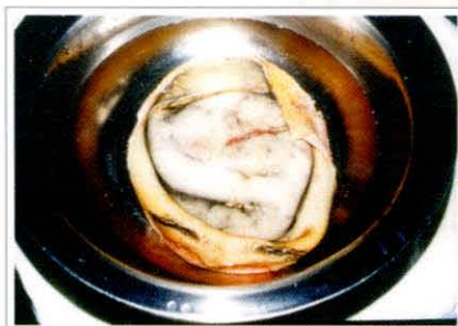
Fig. 3 - Preoperative view of the avulsed segment in saline solution after trichotomy and cleaning.