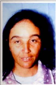
Fig. 9 - Postoperative view after 6 years and 10 months. Frontal view showing hair growth.

Fig. 8 - Pós-operatório 30 dias (vista lateral direita).