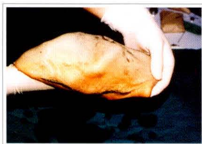
Fig. 4 - Preoperative frontal view of the avulsed segment where the eyebrows can be visualized.