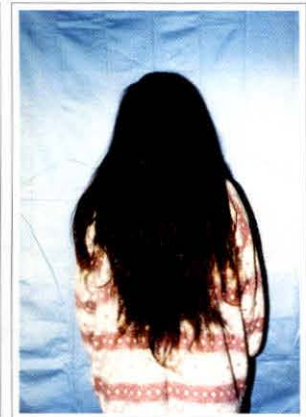
Fig. 12 - Postoperative view after 6 years and 10 months showing hair length, due to religious beliefs.

Fig. 11 - Pós-operatório de 30 dias (vista posterior).