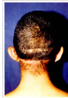
Fig. 11 - 30 days postoperative rear view.

Fig. 10 - Pós-operatório de 6 anos e 10 meses (vista lateral esquerda mostrando seqüelas cicatriciais de orelha esquerda e face).