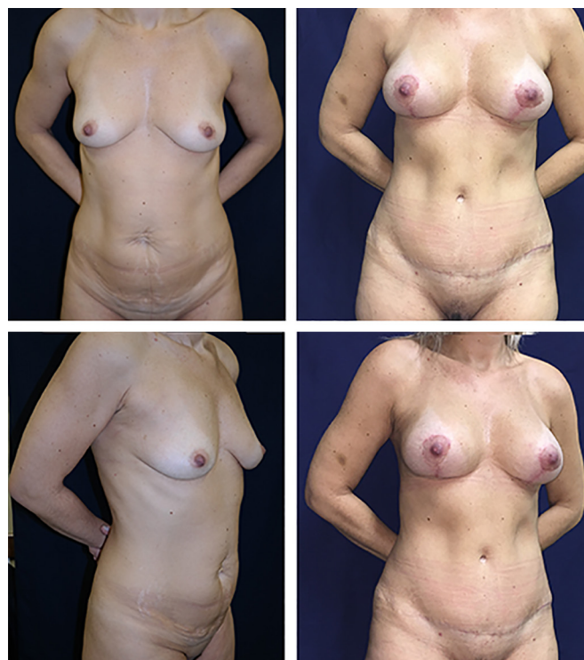
Figure 4. Patients from the lipoabdominoplasty group without Scarpa fascia preservation.

The classic abdominoplasty and lipoabdominoplasty groups had a homogeneous distribution in terms of the variables above; there were no significant