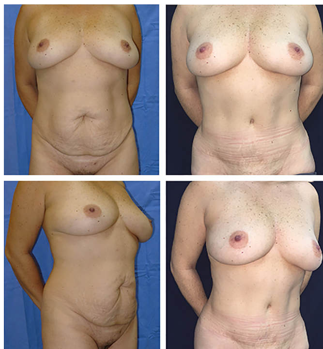
Figure 5. Patient from the lipoabdominoplasty group without Scarpa fascia preservation.

intergroup differences. The mean ages and BMI values were 36.5 and 43.5 years and 24.16 and 24.5 kg/m 2 , respectively (Table 1).