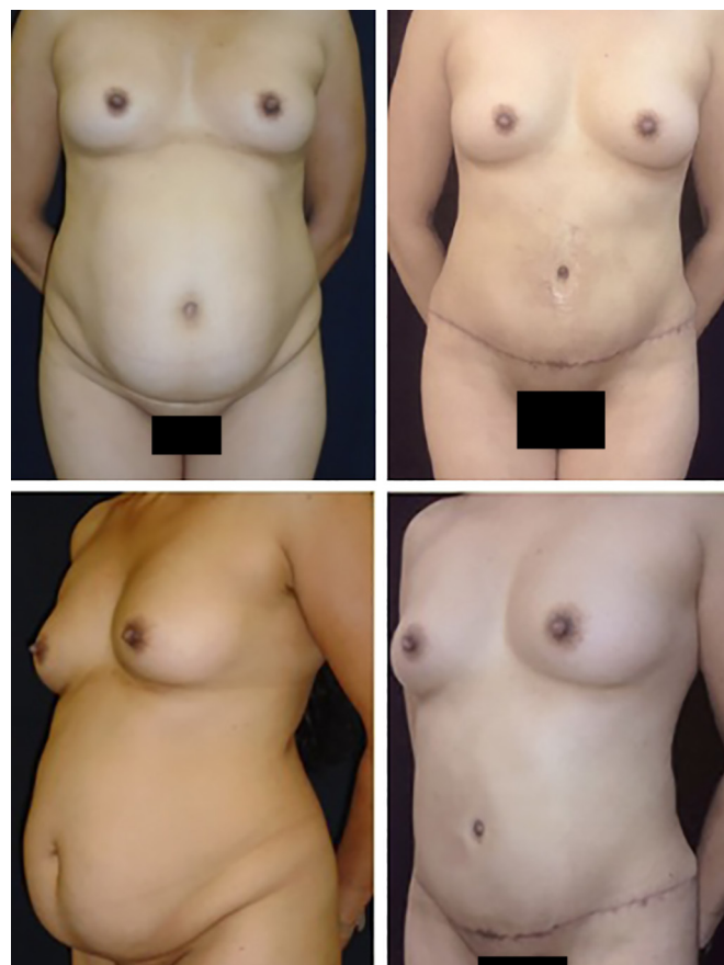
Figure 6. Patient from the lipoabdominoplasty group without Scarpa fascia preservation.

No other postoperative complications requiring pharmacological or surgical intervention occurred