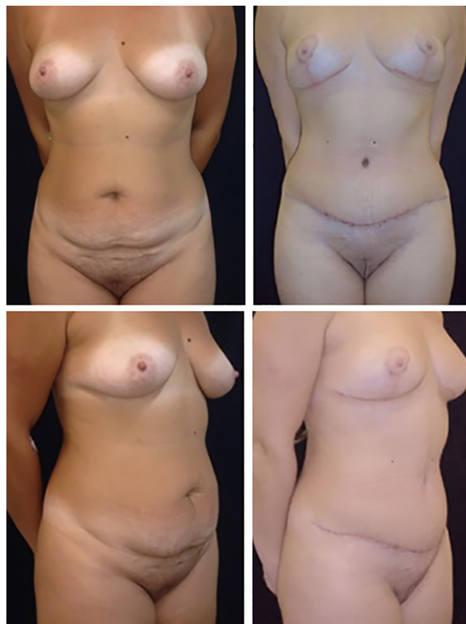
Figure 3. Patients from the classic abdominoplasty group.

The postoperative complication rates (occurrence of seroma) were compared between groups on imaging. Of our 40 patients, 20 underwent classic abdominoplasty (Figures 2 and 3) and 20 underwent lipoabdominoplasty (Figures 4–6). All patients were female. No patient with a history of bariatric surgery or a BMI above 35 kg/m 2 was included in the study. The patients' mean age was 39.8 years, while the mean BMI was 24.3 kg/m 2 . Of the total number of patients, only 10% were smokers, while 17% had other comorbidities.