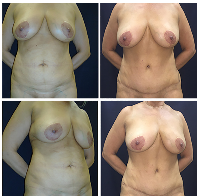
Figure 2. Patient from the classic abdominoplasty group.