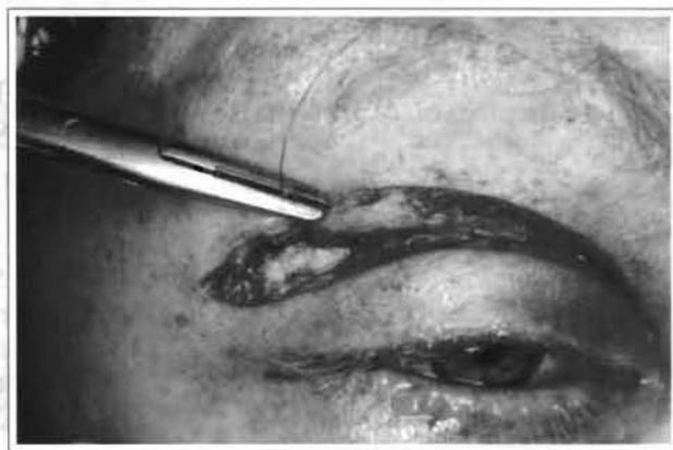
Fig. 2 - Through the superior lid wound we catch the periosteum of the superior orbital rim.

Fig. 1 - Início da cantopexia com incisão de 2 mm próximo ao canto lateral. (seta apontando).