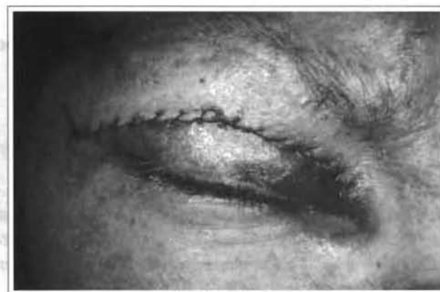
Fig. 6 - Completed superior lid suture.

Fig. 5 - A agulha sai junto ao fio, na ferida palpebral superior, onde é realizado o nó final.