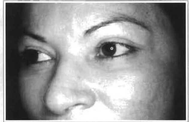
Fig. 7d - Postoperative oblique view.

Fig. 7c - Visão oblíqua. Pré-operatório.