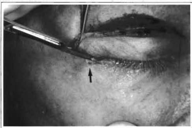
Fig. 1 - Beginning of the canthopexy; 2 mm incision near the lateral canthus (arrow).

Fig. 1 - Início da cantopexia com incisão de 2 mm próximo ao canto lateral. (seta apontando).