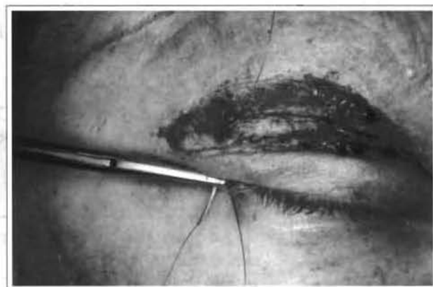
Fig. 4 - The needle is introduced in the same cutaneous incision, catching the inferior branch of the lateral canthal tendon.

Fig. 3 - A agulha sai na incisão no canto lateral.