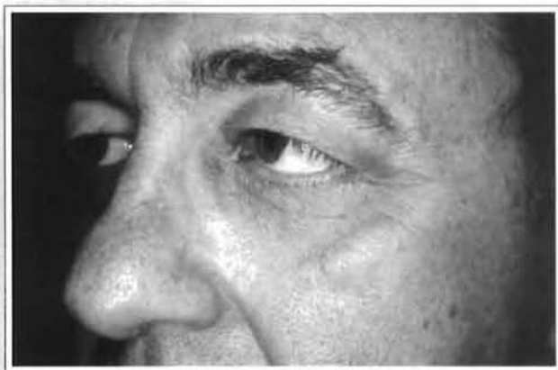
Fig. 10c - Preoperative oblique view.

Fig. 10b - Pós-operatório. Blefaroplastia superior com Laser de CO 2 Ultrapulse e ressecção do Roof. Blefaroplastia inferior transconjuntival, resurfacing da unidade estética periorbitária e cantopexia. Correção total da flacidez e da posição palpebral.