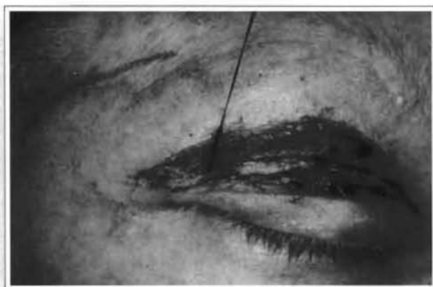
Fig. 5 - The needle comes out near the thread in the superior lid wound, where the final tie is made.

Fig. 4 - A agulha é introduzida na mesma incisão cutânea, apreendendo o ramo inferior do ligamento cantal lateral.