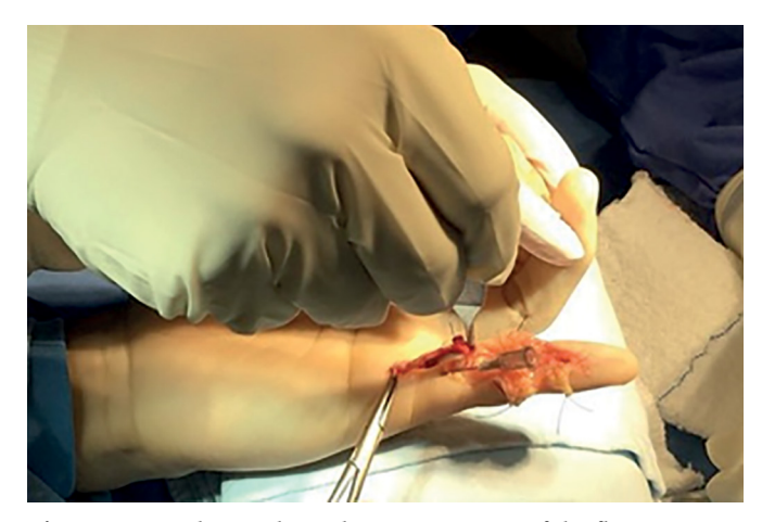
Figure 2. Complete and simultaneous rupture of the flexor tendons of the fifth finger.

repaired. A dressing was applied after suturing, followed by immobilization with a dorsal splint with 10^{\circ} of wrist extension and 90^{\circ} flexion of the metacarpophalangeal joints (Figure 4).