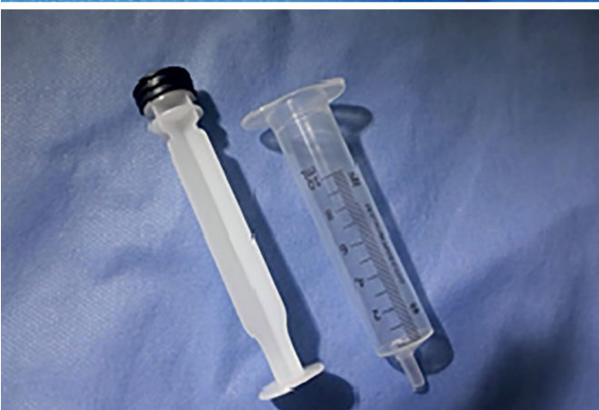
Figure 3. Buttons made with syringe and hypodermic needle.

One year postoperatively, the patient was asymptomatic, the scars had improved appearance, and there were no tendon adhesions. The sensitivity remained unchanged and the functional range of motion of the finger joints were as follows: proximal interphalangeal joint (PIPJ) 10-90°, distal interphalangeal joint (DIPJ) 10-85°, metacarpophalangeal joint (MCPJ) 0-90° (Figure 5). This result is considered good by the scale of the American Society for Surgery of the Hand (ADM > 75%) and excellent by the Strickland's adjusted scale<sup>4</sup>.