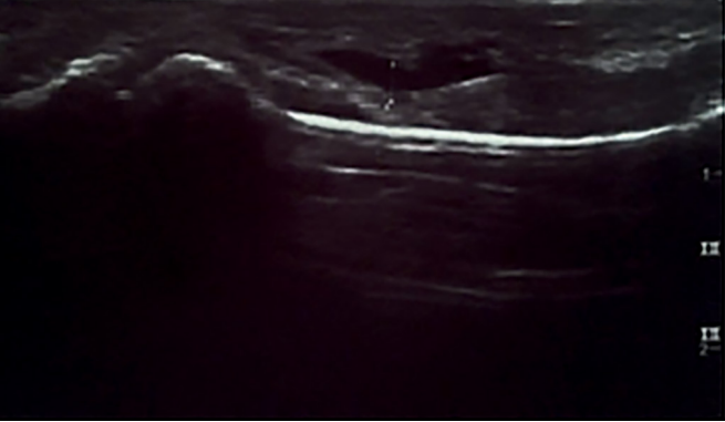
Figure 1. Ultrasound images of the total rupture of the flexor tendons of the fifth finger