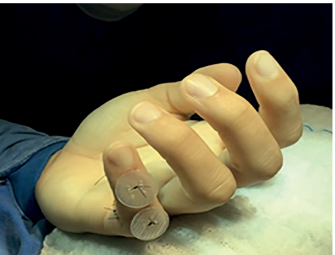
Figure 4. Intraoperative outcome after reinsertion of the tendons using the pull-out techniquea.

Of those cases, all patients were men, with ages ranging from 16 to 49 years (mean of 26.9 years). There were seven cases with one affected finger (ring finger in four cases, middle finger in one case, little finger in two cases), one case with two affected fingers (ring and little fingers) and one case with three affected fingers (index, middle and ring fingers)<sup>6</sup>. In our case, in agreement with the small epidemiology available in the literature, the patient was male, young (25 years old) and only the little finger was affected.