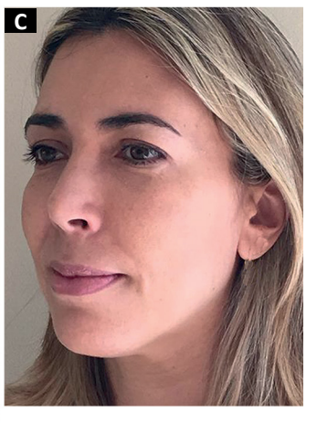
Figure 4. A: Oblique-view images: before surgery; B: After 90 days; C: After 3 years and 1 month. Note that the volume increased after a few years.

A recent study has shown that age affects the viability of adipocytes in specific anatomical regions in different ways and that the lower abdomen is preferred than the flank in patients under 45 years of age. Meanwhile, the flank is preferred to the lower abdomen in patients over 45 years of age. In this study, no difference was observed in the viability of the inner surface of the thigh in the two age groups 14. Therefore, in the future, we may consider the age of the patient when choosing the donor area. However, to date, practicality and availability are still considered more relevant attributes.