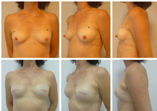
Figure 2. A 52-year-old patient who underwent left skin-sparing mastectomy for invasive ductal carcinoma and prophylactic contralateral mastectomy without nipple-areola complex sparing (decided by the patient). Bilateral breast reconstruction with anatomical prosthesis, profile, height, and moderate projection, 330 mL. Preoperative and 7 months postoperative photographs.