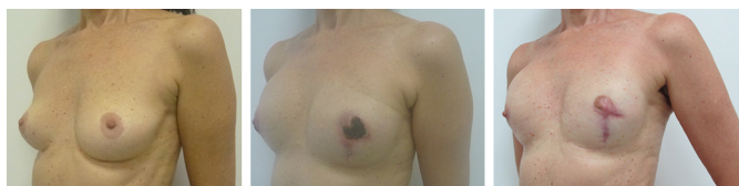
Figure 3. A 66-year-old patient who underwent right mastectomy for invasive ductal carcinoma, developed partial necrosis of the contralateral breast, and underwent prophylactic mastectomy. Bilateral reconstruction with anatomical prostheses, moderate height, and projection, 295 mL. Preoperative, 40 days postoperative, and 6 months postoperative photographs.

(30.76%). A total of 8 complications in 26 reconstructed breasts (30.76%) were recorded.