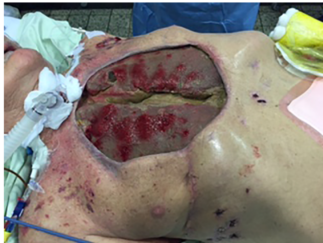
Figure 1. Open bleeding area in the anterior chest wall with exposure of the sternum, ribs, and pericardium.

The cutaneous ulcer measured approximately 19 cm in width and 23 cm in length longitudinally and presented a poor granulation tissue (Figures 1 and 2). He also presented a recent middle incision in the upper abdominal wall, at a distance of 9 cm from the ulcer, and partial dehiscence. The lower right pectoral region had a recent scar in the lateroposterior direction, of approximately 14 cm long.