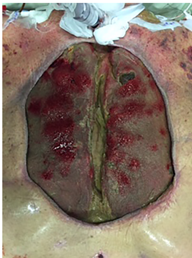
Figure 2. Open bleeding area in the anterior chest wall with exposure of the sternum, ribs, and pericardium.

Along with intensive clinical care to control infection foci (lung and urine) and advanced life support, local wound care was initiated. Surgical debridement, hyperbaric oxygen therapy in a monoplace chamber, and