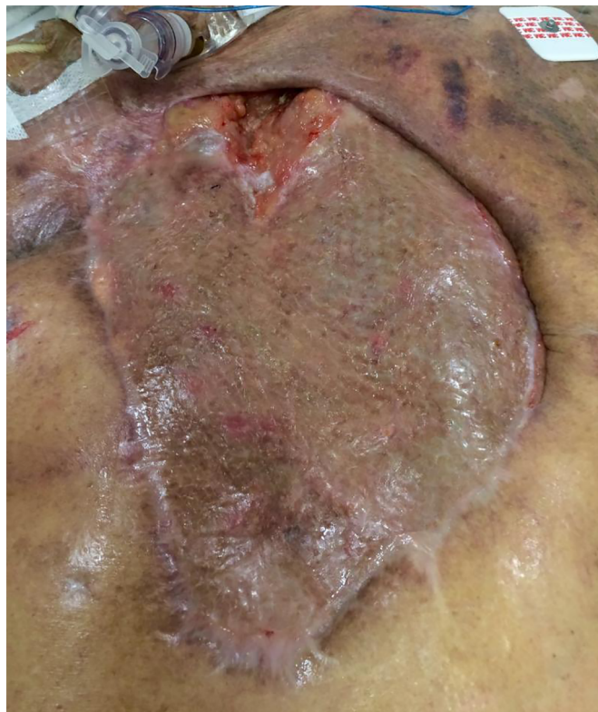
Figure 5. Final aspect after a meshed skin graft.

Moist dressings were placed daily to ensure flap hydration, and >25 days were necessary to obtain an appropriate granulation tissue, which allowed cutaneous coverage. Then, a split mesh skin graft of the right thigh was performed with an electric dermatome, with the integration of approximately 90% of the grafted area (Figure 5).