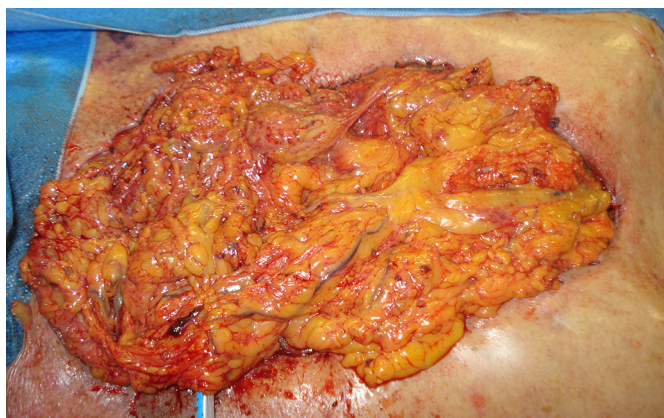
Figure 3. Intraoperative aspect of the omentum flap already transferred to the bleeding area.

Twenty days after the implementation of this therapeutic scheme and with evident improvement of the local wound conditions, the patient underwent a sternal approximation performed by the thoracic surgery team and omentum flap rotation performed using video-laparoscopy by the digestive tract surgery team. The flap generated was based on the vascular pedicle of the left gastroepiploic artery and transferred to the thoracic region by a layer of skin between the upper abdominal incision and the ulcer (Figures 3 and 4).