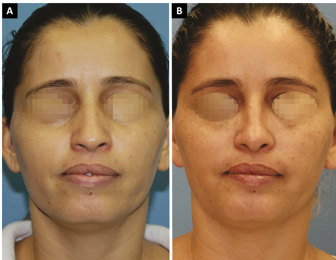
Figure 7. A: Case 7. Frontal view; B: Frontal view 12 months after the closed rhinoplasty. The central portion of the septum was removed using a Killian incision. Resection of the cranial portion of the lateral crus was made using a transcartilaginous incision. Reduction of the cartilaginous back was performed using Fomon scissors. The cartilaginous dorsum was slightly recessed with a #11 scalpel blade without opening of the ceiling. A radix graft with double linear septal cartilage was performed in the proximal portion. A double-tip graft was made without fixation with sutures. An internal low-high osteotomy was performed. There were no struts or sutures from the tip cartilage.

Relative to the preoperative period, your nose is: (-2) much smaller; (-1) a little smaller; (0) the same size; (1) a little bigger; or (2) much bigger.