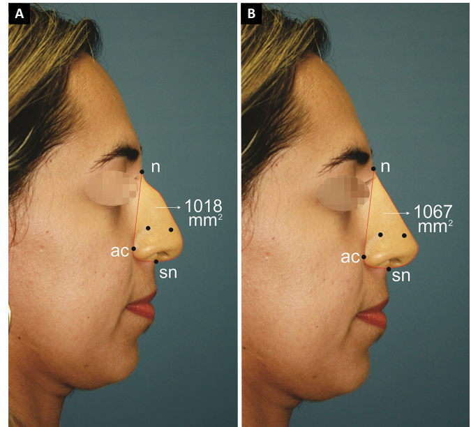
Figure 2. A: Case 9. Images before and after the intervention created by computer graphics. There was an increase of the radix and tip without lowering of the dorsum; B: The red line delimits the perimeter of the nose. The nasal area is shown in square millimeters. The two black dots are 15 mm apart and are used to calibrate the program.

After the registration phase, we divided the study cohort into two branches. One of them underwent