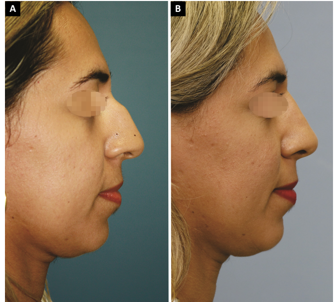
Figure 4. A: Case 9. Preoperative profile view; B: Case 9. Profile view 12 months after rhinoplasty. The technique was described above.

To evaluate the nasal size perception, each patient judged their own case. The exact point of time of the analysis was 90 days after surgery, and all pre- and