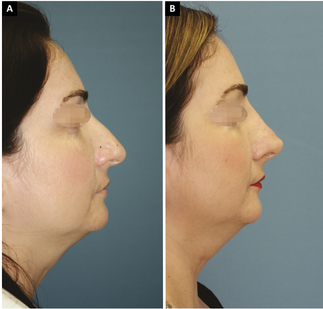
Figure 6. A: Case 8. Preoperative profile view. 6B. Case 8. Profile view 12 months after the rhinoplasty. Technique described above; B: Case 8. Profile view, 12 months after rhinoplasty. Technique described above.