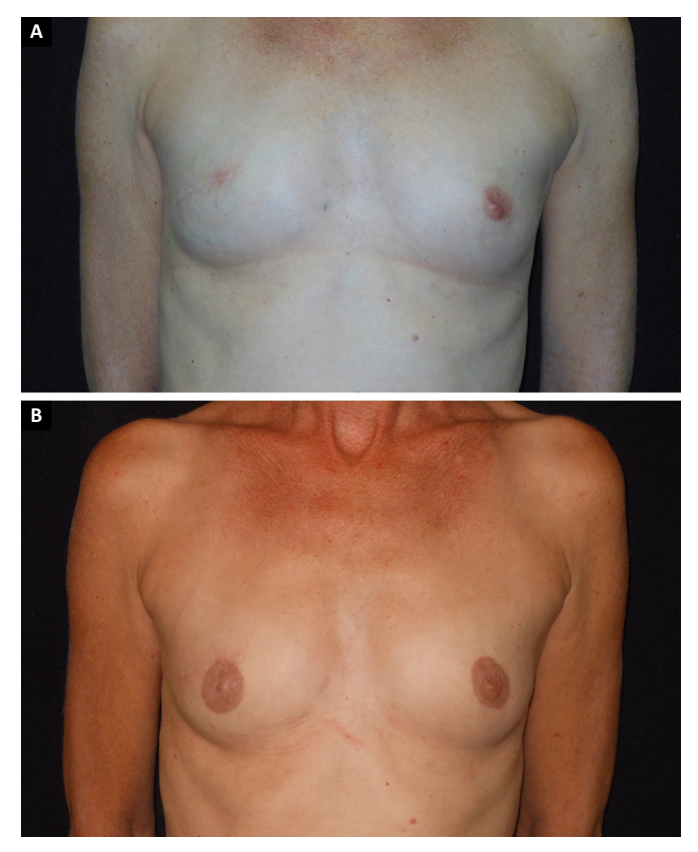
Figure 4. A: Patient with small breasts treated with right skin-sparing mastectomy and late two-stage reconstruction with a fat graft; B : Result 1 year after reconstruction of the right nipple-areola complex and bilateral tattooing with an increase in the circumference of the original areola.