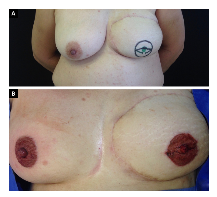
Figure 3. A: Preoperative marking in a patient with a previous reconstruction using a transverse myocutaneous flap of the rectus abdominis; B: Immediate postoperative result. Note the tattooing of the original nipple-areola complex to ensure that the color was similar to that of the contralateral side.

complications related to tattooing (Table 1). None of the evaluated patients needed retouch of the tattooing of the reconstructed NAC in the 2-year follow-up period (Figure 4). One patient needed to increase the size of the contralateral areola by tattooing to maintain diameter symmetry.