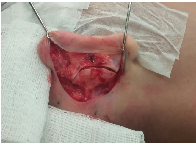
Figure 1. Exposure of the conchal cartilage while keeping the posterior perichondrium intact.

After the end of this rhinoplasty phase and preparation of the space to augment the dorsum, the auricular conchal cartilage was captured along with its perichondrium and mastoid fascia. A spindle of retroauricular skin was removed without removing the perichondrium. The upper portion of the graft to be obtained (lateral side of the nasal concha; Figure 1) was cut. This was then removed from the skin of the anterior portion of the concha until the desired width and length of the graft was attained, and the lower part of the graft was entirely incised, antero-posteriorly, by preserving the perichondrium (Figure 2).