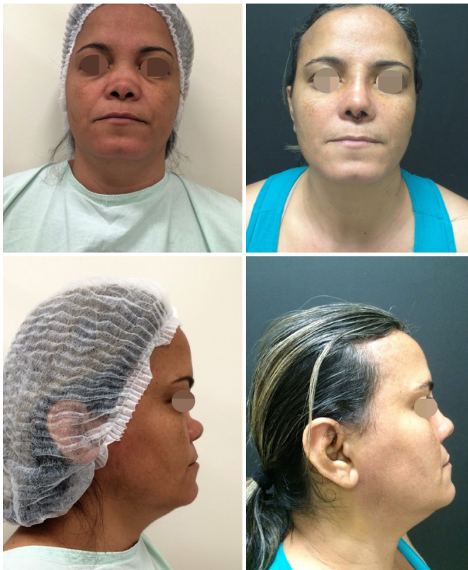
Figure 9. Traumatic sequelae before and after operation.