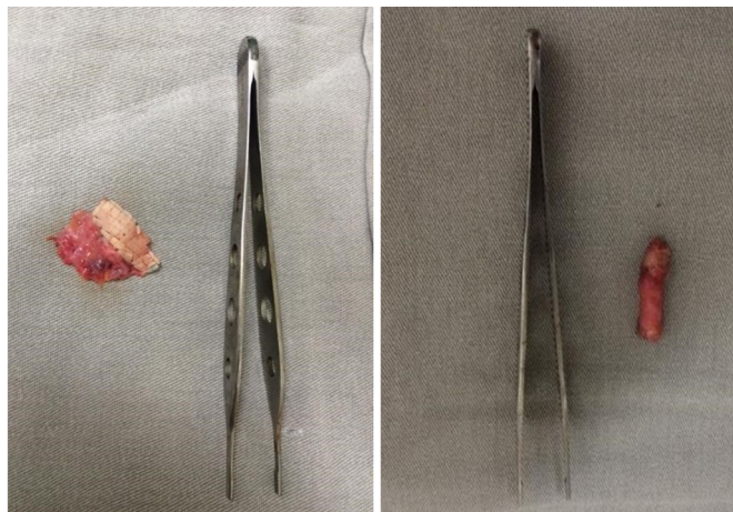
Figure 4. Composite graft. A. Conchal cartilage fixed to the posterior perichondrium and mastoid fascia. Cartilage incisions were made on the anterior face of the cartilage without incising its posterior perichondrium to fragment the cartilage without detaching it. B. Prepared composite graft with cigar-like appearance.