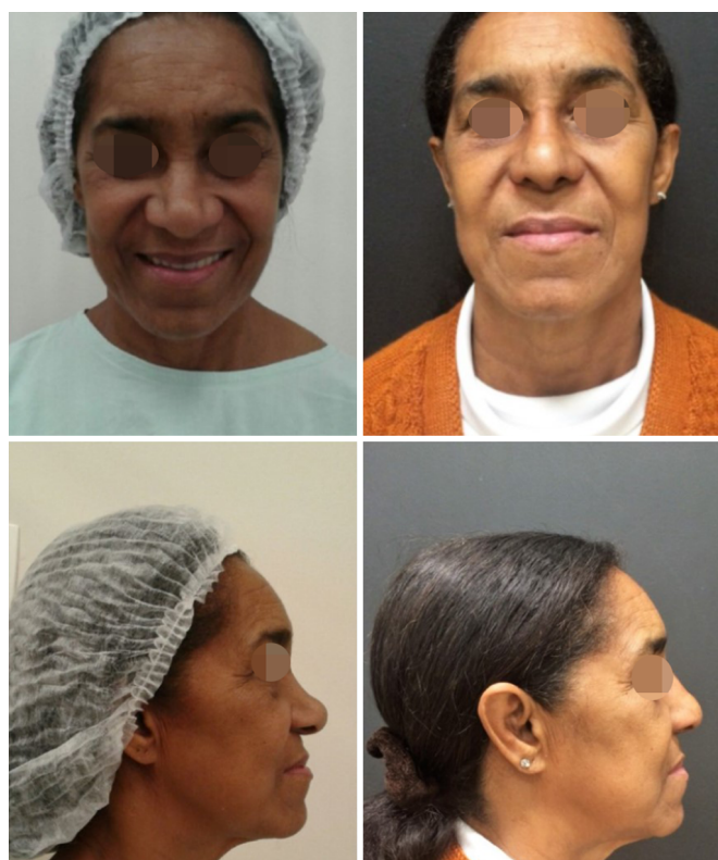
Figure 7. Ethnic characteristics before and after operation.