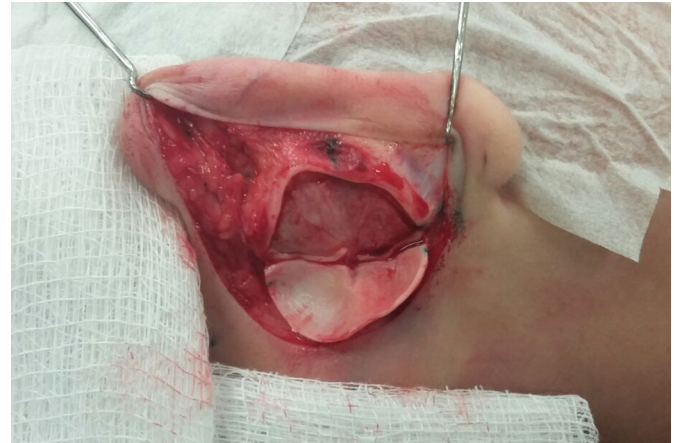
Figure 2. Lifting the nasal concha without its anterior perichondrium. The posterior-most incision of the nasal concha is made without damaging the posterior perichondrium.

The graft was folded, and the mastoid fascia was detached from front to back until reaching the desired length and width (Figure 3). The fascia was incised and then fixed to the perichondrium. The cartilage was fragmented with a scalpel, maintaining the connection of the three structures. Subsequently, the cartilage was wrapped in the fascia and fixed to it with 6.0 mononylon wire, making these structures look like a cigar (Figure 4).