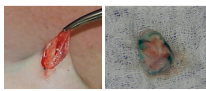
Figure 2. Umbilical scar skin.

the skin, this measures approximately 1.5 cm in diameter and corresponds to the pre-existing umbilical scar in the abdominal flap. With a scalpel blade No. 15, the skin is resected with partial dermal thickness (Figure 2) and placed in a tank with saline solution for subsequent grafting.