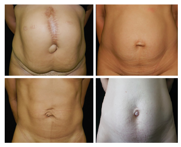
Figure 1. Pre-operative.

the skin, this measures approximately 1.5 cm in diameter and corresponds to the pre-existing umbilical scar in the abdominal flap. With a scalpel blade No. 15, the skin is resected with partial dermal thickness (Figure 2) and placed in a tank with saline solution for subsequent grafting.