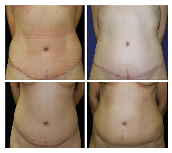
Figure 5. Late post-operative.

and performing circular incisions on the skin of the abdominal flap ^{3-5} .