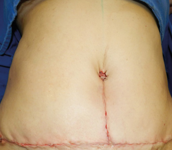
Figure 4. Immediate post-operative.