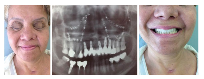
Figure 8. Late postoperative patient showing excellent facial volumetric replacement with bilateral orbits, absence of telecanthus, no visual complaints, and absence of complaints with respect to bilateral subciliary scars; Panoramic radiography; anatomical reconstruction of the face with symmetrical and normal positions of the orbits and occlusion in class I in the midline, denoting correct reconstruction of the facial abutments.