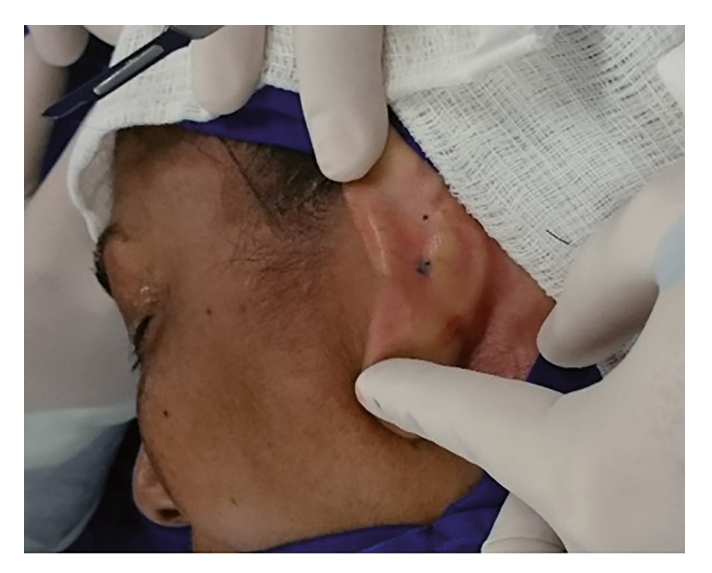
Figure 1. Demarcation of the auricular conchal limits.

Demarcation was established with methylene blue at the limits of the auricular concha, followed by incision, and posterior and anterior subperichondrial detachment of the concha (Figure 1). All anatomical auricular units of the helix, scapula, and anti-helix were preserved during the subperichondrial detachment and resection of this cartilage.