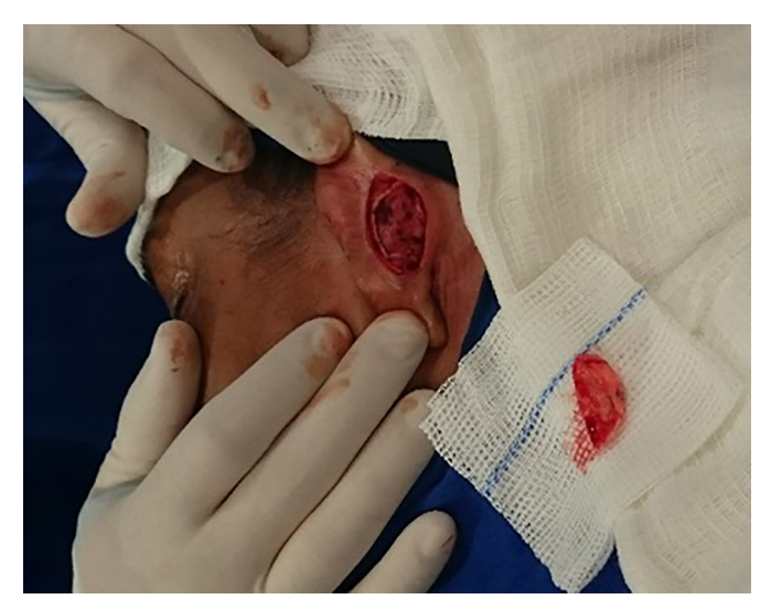
Figure 2. Resected concha with preservation of the perichondrium.

of the orbit, in the transition from the palpebral skin to the malar skin, the orbicularis muscle was sectioned in its orbital portion.