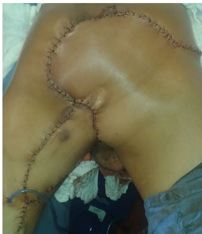
Figure 6. Final aspect at the immediate postoperative period.

performed together with neoadjuvant chemotherapy. The attempts to conduct primary closure of perineal wounds frequently result in complications 4 due to the following: suture under tension, great dead pelvic space caused by oncological resection, field contamination, and poor-quality perineal skin already previously irradiated 1 .