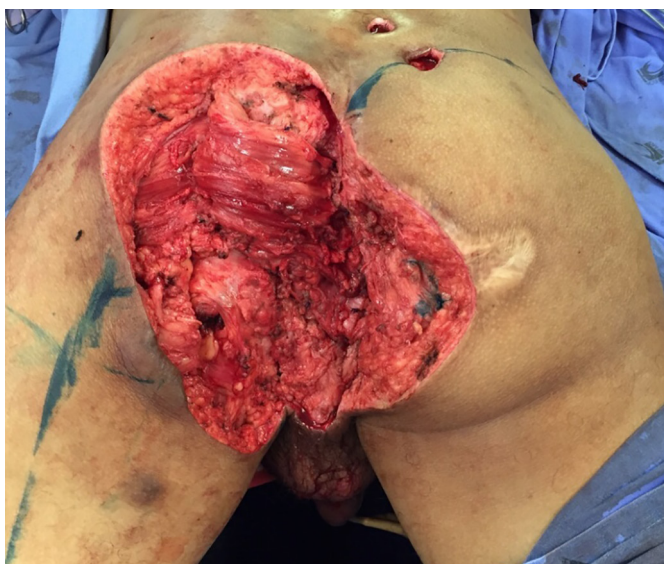
Figure 4. Positioned muscle flap.