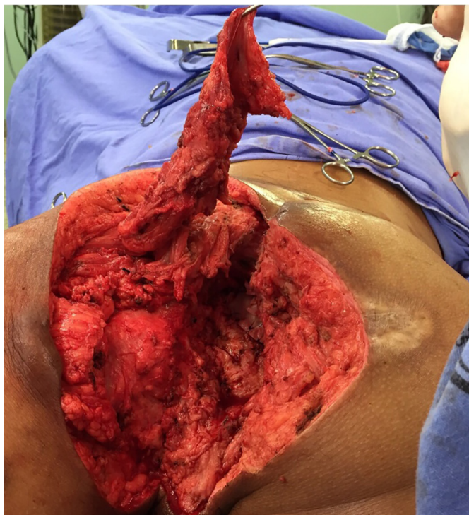
Figure 3. Positioned bovine pericardium and muscle flap of the maximus gluteus highlighted.