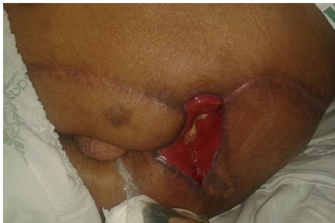
Figure 7. Area of local dehiscence.