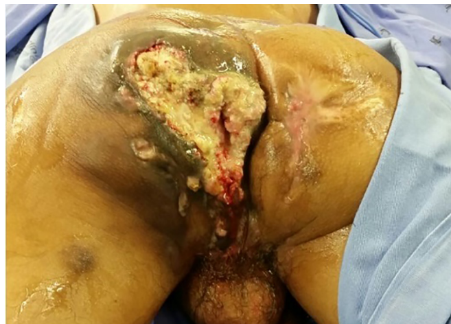
Figure 1. Squamous cell carcinoma of the anal canal with involvement of the gluteal region.

The patient showed good postoperative progression. In the fifth postoperative day (POD), the patient presented a small dehiscence in the confluence point of the three flaps. The dehiscence stopped its progression, reaching a maximum dimension of 4 cm, being treated in a conservative way, without requiring new surgical procedures such as closure by secondary intention (Figure 7).