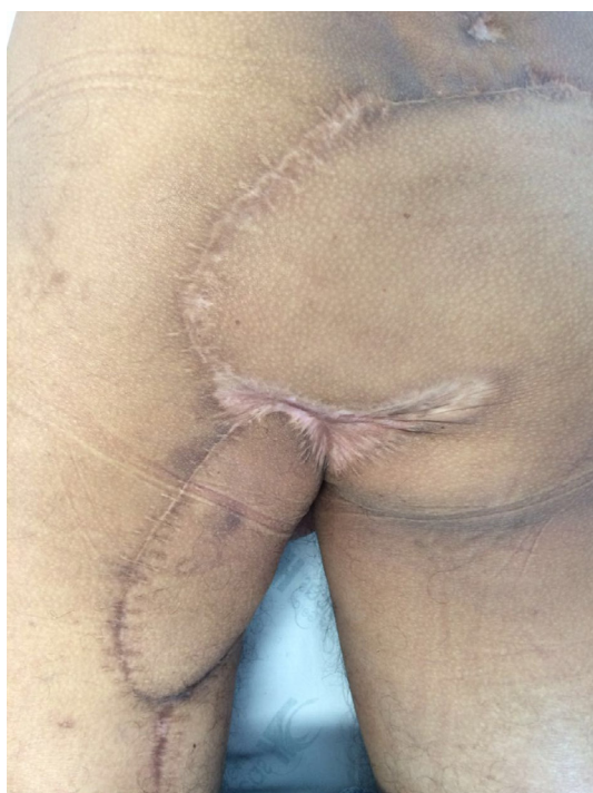
Figure 8. Final aspect at the time of return to ambulation.

in the sacral area. Extensive resections such as the one described herein generally require local and regional flaps for closure.