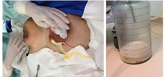
Figure 3. Intraoperative image. Reintervention surgery for drainage of galactoceles.

The patient made one last follow-up visit with the physician nearly 60 days after the last procedure.