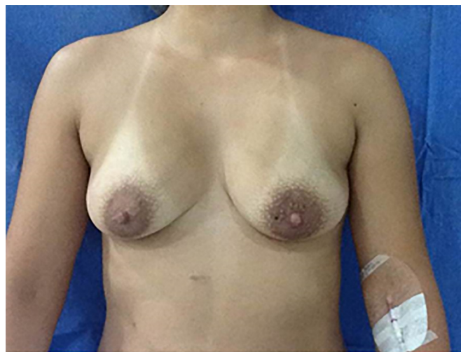
Figure 1. Preoperative image, prior to augmentation mammoplasty.

augmentation mammoplasty with inclusion of a 350-cc, textured, round, high-profile Mentor prosthesis by using the infra-areolar and trans-mammary approaches, positioned at the subglandular plane. During the procedure, rhinoplasty and submental and anterior axillary region lipoaspiration were performed. The surgery was performed without complications, and the patient was discharged on the same day.