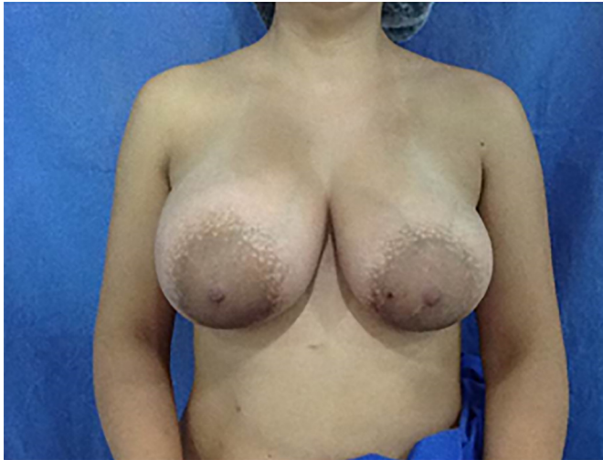
Figure 2. Postoperative image, after augmentation mammoplasty. Breast asymmetry in galactoceles.

Laboratory tests were requested, and no alterations were observed. Bilateral breast ultrasonography revealed discontinuity of the left breast prosthesis, with a possible rupture. The patient had a history of using contraceptive and antidepressant (sulpiride) medications prescribed by a gynecologist. She started the use of sulpiride 2 years 4 months before. Eventually, she presented bilateral galactorrhea, a symptom collateral to the medication used. After inclusion of the breast prosthesis, the patient no longer presented this symptom.