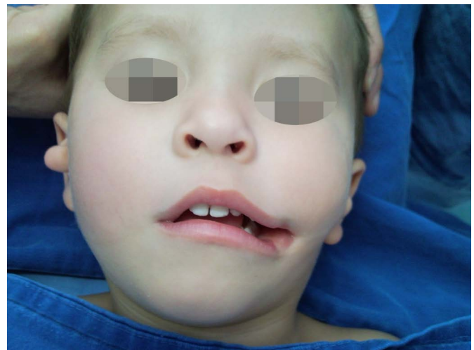
Figure 1. Unilateral left macrostomia.

Patient 1 (Figure 1): Male patient, 3 years old, presenting with hemifacial microsomia together with a left unilateral Tessier 7 cleft. Surgery was performed under general anesthesia. The marking of the new commissure was drawn by transferring the contralateral mucocutaneous zone, but with a 2-mm increase at the upper point. Infiltration with 2% xylocaine and epinephrine (1:200,000) was performed. The incision was performed on the mucocutaneous zone with dissection of quadrangular mucosal flaps, these being reversed to the oral cavity. The orbicularis oris muscle was dissected (Figure 2), reoriented, and sutured with nylon 4.0. The skin is then sutured after zetaplasty (Figure 3). Figure 3 was designed and drawn by the author.