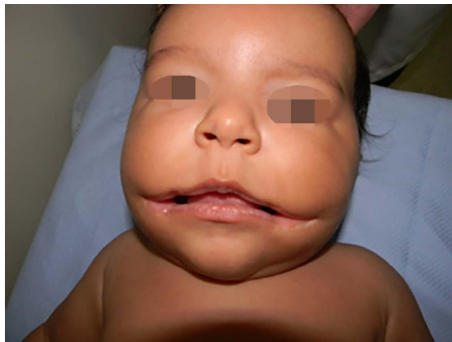
Figure 4. Bilateral macrostomia.