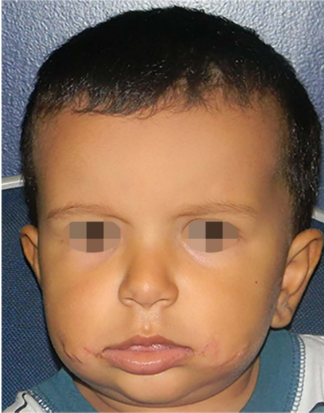
Figure 6. Two-years after correction of bilateral macrostomia.

With regard to the unilateral commissuroplasty, published data are more elaborate and the marking of the new commissure can be performed according to Mathes' method. The author used the distance between the philtrum and the commissure contralateral to the defect. This distance is then transferred to the malformed side with an overcorrection, as a scar contraction is expected.