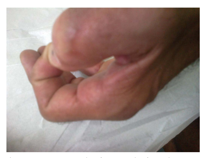
\textbf{Figure 2.} \ Late \ postoperative \ period, satisfactory \ scar \ without \ functional \ impairment.

There were no complications and no wound dehiscence, infection, or seroma were observed (Figure 2). Conventional suture of the wound with nylon 3-0 was performed fifteen days after the withdrawal of the elastic suture.