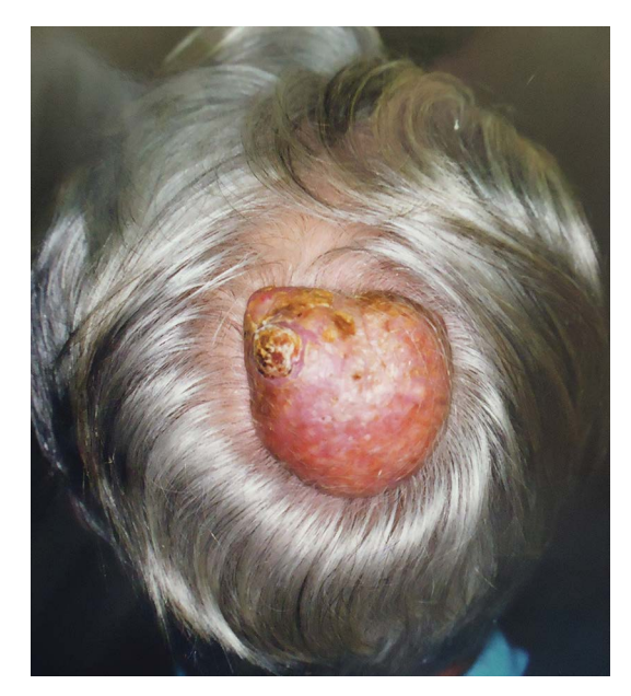
Figure 2. Friable, ulcerated lesion, of about 3 years of progression, in the scalp of a 71-year-old male patient. Histopathological analysis showing malignant proliferative trichilemmal tumor with squamous degeneration area (ulcerated area between 10 and 11 hours).

Differential diagnosis includes benign tricholemmal cyst, squamous cell carcinoma (Figures 2 and 3), basal cell carcinoma, keratoacanthoma, verrucous cysts, proliferative trichilemmal cysts, and pseudocarcinomatous cysts<sup>5,12</sup>.