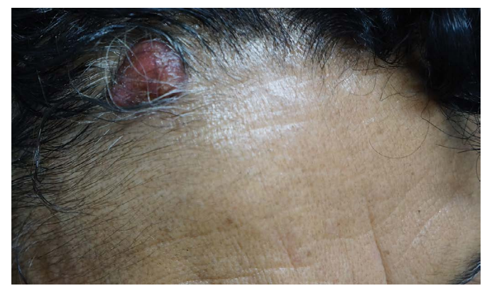
Figure 1. Clinical aspect of the lesion in the scalp of a 54-year-old woman, with one-year progression. Biopsy revealing a trichilemmal carcinoma.

TC usually occurs as a solitary lesion<sup>9</sup>, predominantly in the head and neck regions<sup>10</sup>. Clinically, it appears approximately one year before diagnosis with a rapid growth rate<sup>11</sup>.