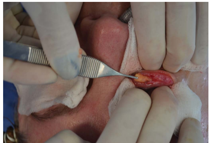
Figure 2. A horizontal conjunctival incision and access to the fat bags without injury to the orbital septum.

(lower eyelid retractors), with the middle lamella kept intact. A Desmarres lid retractor was placed and gentle downward pressure was applied to the eyeball by the assistant, exposing the herniated periorbital fat in the following order: medial, median, and lateral (Figure 2).