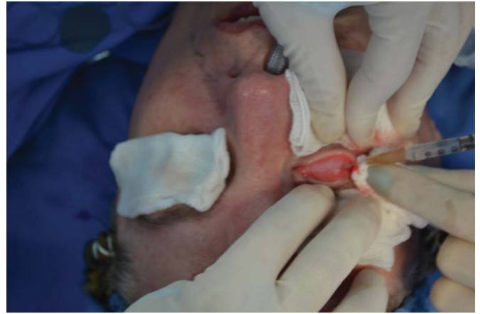
Figure 1. Infiltration of the lower conjunctiva, fat bags, and lower palpebral skin with a 2% lidocaine and epinephrine 1:100,000 solution.

A horizontal 3-4-mm conjunctival incision with retroseptal access was made in the lower tarsal plate, at the level of the second vascular arcade with a delicate electrocoagulation tip. This approach allows access to the fat bags without breaching the orbital septum. The dissection continued through Müller's muscle and the capsulopalpebral fascia