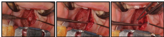
Figure 1. Intravelar veloplasty procedure.

The primary palatoplasty was performed using the principles of the von Langenbeck technique, which features closure of the soft palate in three layers with or without a relaxing incision associated with intravelar veloplasty. In this case, broad muscle detachment of the nasal mucosa was performed with scissors and a Freer elevator with minimum detachment of the oral mucosa. The Freer elevator was subsequently used for muscle repositioning by smoothly pushing the partially adhered musculature to the oral mucosa and wide detachment from the nasal mucosa to a more posterior position (Figure 1).