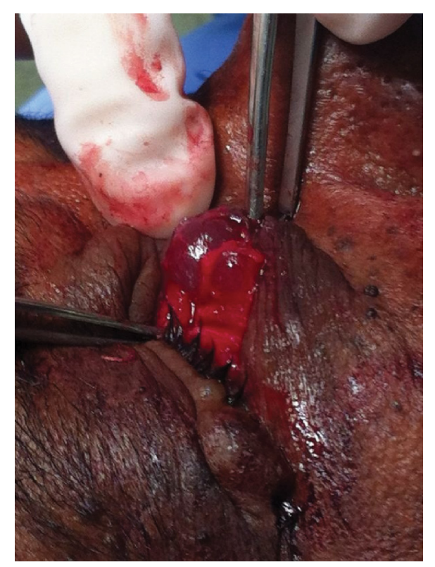
Figure 4. Extraction of the lesions - The lesions had an intact capsule.