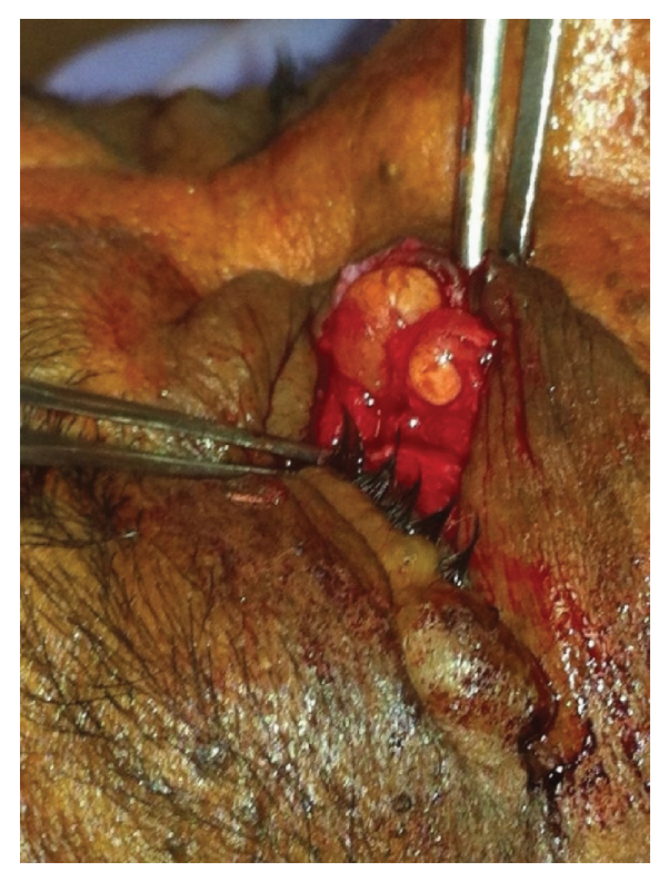
Figure 3. Careful dissection of the lesions - The already exposed, large lesions had an intact capsule.