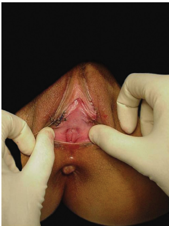
Figure 7. Immediate postoperative period.