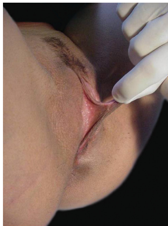
Figure 3. Identification of redundant tissue. Preoperative aspect of the labia minora.