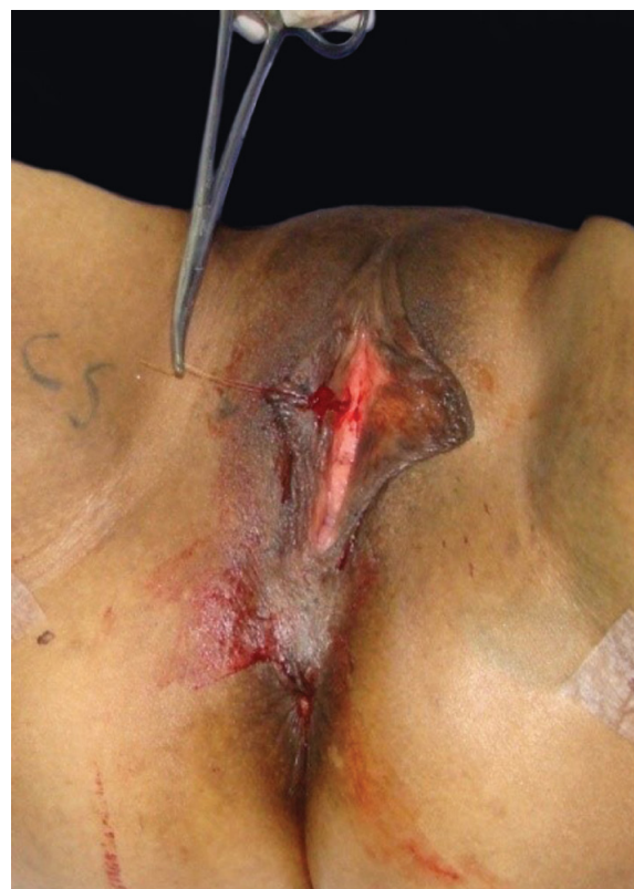
Figure 5. Surgery. The suture was performed with the aid of straight tweezers, at points uniting A and A'.