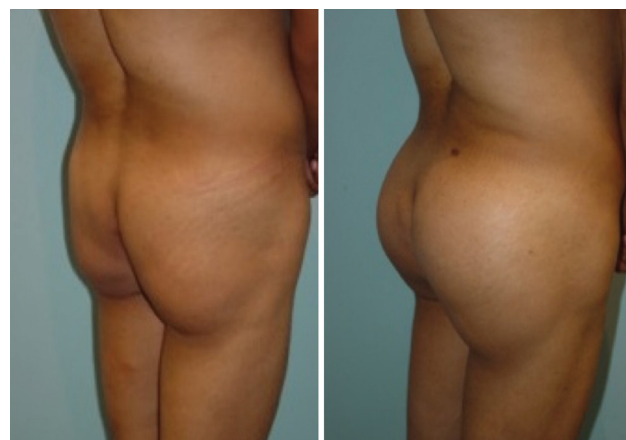
Figure 3. A.A.O., a 38-year-old woman. Pre- and post-operative view of the buttocks (including an implant).