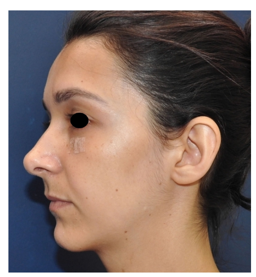
Figure 10. Preoperative view of patient 2.