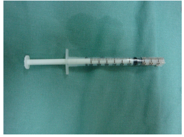
Figure 3. Prepared syringe.