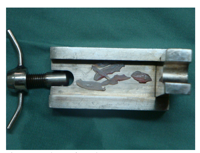
Figure 1. Cartilage grafts used.

The 37 patients were monitored postoperatively and underwent periodic evaluations on days 7, 15, and 30; after 3 and 6 months; and after 1 and 2 years. We operated on six men and 31 women who were 18–55 years old. In all cases, we obtained the expected results, i.e. successful increase of the nasal radix (Figures 8–13). A consolidated diced graft was observed during the late clinical follow-up period and the patient did not present any shape deformities.