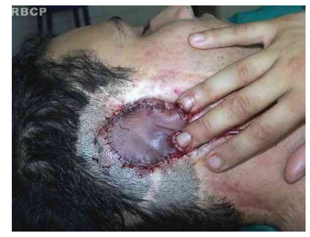
Fig.6. A flap sutured in the receiving area of the cyanosed segment.

area, and the area of the suture was marked with a marker. The skin of the auricular area and the scars were removed as much as possible, ensuring that the flap's margins were sutured to the edges that were in good condition (i.e., without scars); a small area of the scalp was invaded. The suture was performed using nylon 5-0 (Fig. 6).