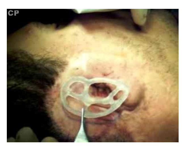
Fig 8. Soft skin marked for implant placement.

Fourth surgical stage. At 8 months, once the new skin in the auricular area was soft, a silicone auricular implant (model Arrunátegui) was placed underneath (Fig. 8).