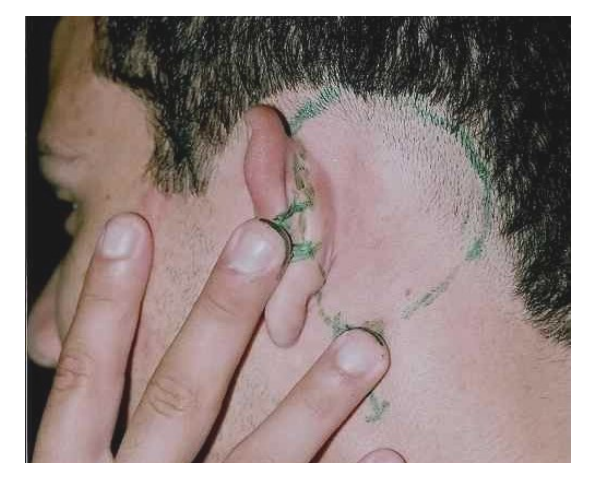
Fig.3 .Defining the skin of the left retroauricular area that could be used to reconstruct the right side. The pedicles for the flap were drawn at the height of the third and fourth finger pulps.

Two right-hand finger pulps were selected (second and third fingers), with the hand, arm, and head in a comfortable position for the patient at the time of transfer (Fig. 3).