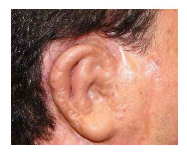
Fig.9B. Definitive postoperative appearance 3 years after the start of the reconstruction.