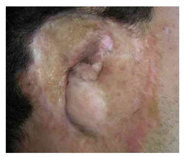
Fig.9A Before the start of the reconstruction.

Sixth surgical stage. Because the left ear was protruding relative to the reconstructed right ear, the left ear was corrected (Fig. 10A, 10B).