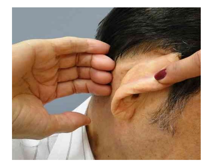
Fig.11. Proposed position of the hand and fingers for future similar cases.

4 – The bloody parts of the pedicles that remain exposed should be covered with thin scalp grafts. After the pedicles were sutured to the finger pulps, the physiological position of the fingers (slight flexion relative to the hand) caused the pulps to apply light pressure to the deep tissues, which probably hindered the revascularization of the flap. Therefore, the author believes that the most comfortable and ideal position for the hand and fingers is that shown in Fig. 11.