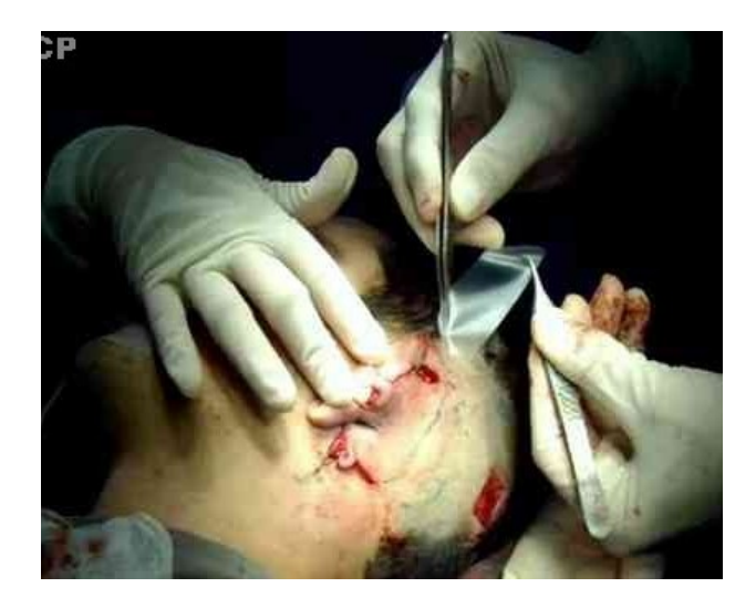
Fig 4. Thin silicone sheet being placed under the flap.

A thin silicone sheet (score 50–0.50) was placed over the entire detached area of the flap as well as one drain of the same material, to avoid flap revascularization (Fig. 4).