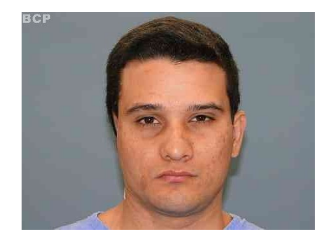
Fig. 10B. After the correction.