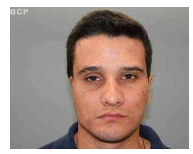
Fig.10A. Protruding left ear.