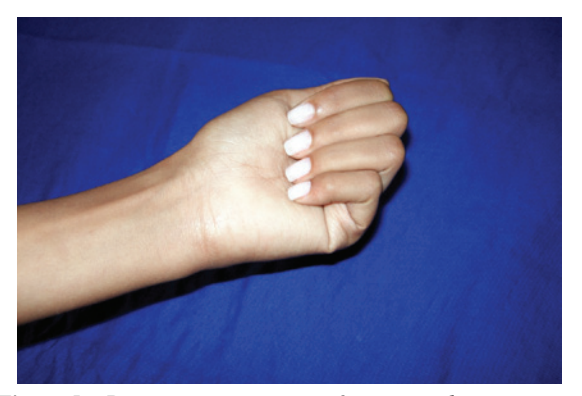
Figure 5 – Postoperative aspect at 2 years, with preservation of flexion of the fifth finger of the left hand.