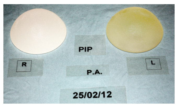
Figure 3 – Aspect of the removed implants.

Rev Bras Cir Plást. 2013;28(3):343-7 345