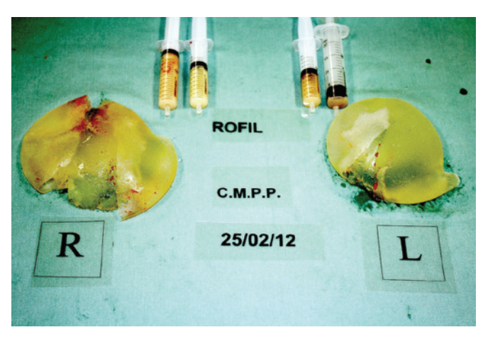
Figure 6 – Rupture of the Rofil implant.