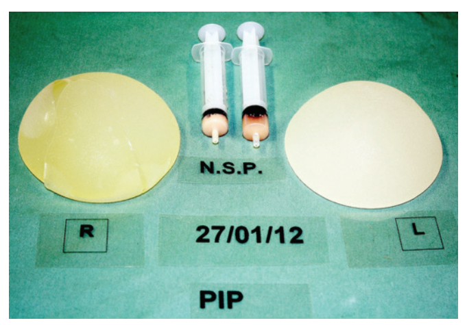
Figure 5 – Rupture of the PIP implant.