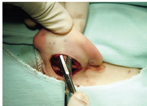
Figure 3 – Perioperative demonstration of wide undermining of the posterior aspect of the ear in perichondral layer up to the margin of the helix.

We used the retroauricular access to perform an incision in the spindle and resect the skin according to the preoperative marking to ensure that the resultant scar was positioned in the retroauricular sulcus. Then, the entire posterior surface of the ear was detached from the perichondrial plane and attached to the lateral margin of the helix (Figure 3). In addition, we dissected the mastoid region, resected the musculoligamentous tissue, exposed the periosteum of the mastoid, and created a space for rotation and fixation of the concha (Figure 4). The posterior auricular muscle was preserved in cases of mild and moderate conchal hypertrophy but resected in cases of severe hypertrophy to create a larger space for conchal rotation. Hemostasis was achieved via direct vessel cauterization using a bipolar electrocautery.