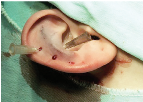
Figure 6 – Perioperative demonstration of scafoconchal suturing defined by transcutaneous needle marks.