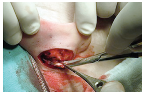
Figure 4 – Perioperative demonstration of mastoid dissection and resection of soft tissues.