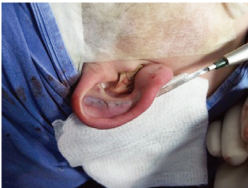
Figure 5 – Perioperative demonstration of definition of ante-helical fold by anterior scarring with rasp.

The dressing was performed using damp cotton molded to the depressions and grooves of the ear, gauze, cap-shaped dressing, and bandage, which were removed on the second postoperative day. After removal of the dressing, the patients wore a noncompressive elastic bandage for 15 consecutive days and then only at night for 60 days. The suture of the retroauricular skin was removed on postoperative day 14. The patients were followed up as outpatients, with visits scheduled on postoperative days 7, 14, 30, 90, and 180. They were discharged from follow-up 12 months