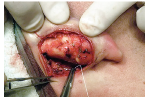
Figure 8 – Perioperative demonstration of conchal protrusion corrected by conchomastoideal sutures, as described by Furnas.