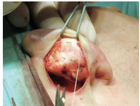
Figure 7 – Perioperative demonstration of needle marks and their maintenance during sutures, helping in the procedure.