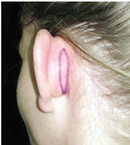
Figure 1 – Surgical marking of a conservative retroauricular fusiform skin resection after simulation of ear rotation.

The surgical procedure was initiated with local antisepsis using a chlorhexidine aqueous solution. The hair was prepared using cap-shaped sterile fields and micropore for patients with long and very thin hair (Figure 2), as well as an ear plug for ear canal protection. Then, anesthetic blockade of the main nerve branches of the ear and infiltration of the mastoid area, posterior auricular surface, and antihelix were performed using a 10-mL solution of 2% lidocaine with adrenaline and 10 mL of ropivacaine at 10 mg/mL. Approximately 6 mL of solution was used in each ear. Local blockade and general anesthesia were performed concomitantly in pediatric patients and patients who were undergoing combined