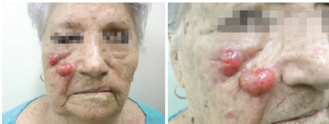
Figure 2 – Female patient, 86 years old, underwent to resection of a skin lesion in right malar region and reconstruction with autograft skin. The diagnosis of Merkel cell carcinoma was obtained only after the initial treatment. Experienced local recurrence and submandibular lymph node on the right, 1 year after the procedure.

Distant aggressiveness was also a factor indicative of poorer prognosis. Distant metastases occurred during or following treatment in 32% of cases. Of these 8 patients, 3 had diffused cutaneous dissemination, even at sites distant from the site of the primary tumor. This diffuse recurrence in the skin and in the subcutaneous cell tissue has been described as being more common in immunocompromised patients 16 , a fact that was found in one of these cases in which the MCC occurred in a patient with acquired immunodeficiency. The disease progressed rapidly and the patient died from