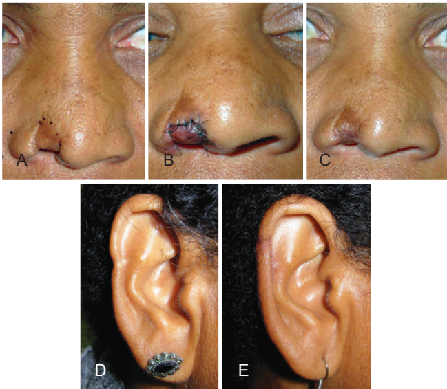
Figure 3 – Case 3. In A , preoperative appearance of nasal alar sequelae caused by a human bite. In B , recent postoperative appearance (sixth postoperative day) showing a purple-red composite graft. In C , appearance at 1 year after surgery. In D , ear sequelae caused by a previous surgery. In E , postoperative appearance upon new composite graft donation of the indicated region and repair of the defect using a skin helix advancement flap.

In 2006, the patient underwent right nasal alar reconstruction using a composite graft (skin and cartilage) from the helix of the right ear. An advancement skin flap was created from the helix of the right ear to correct auricular deformities. The graft was purple-red until almost 6 days after surgery (Figure 3B). After that point, the surgical wound presented a satisfactory appearance, although moderate final hyperchromia of the graft was observed 1 year after the surgery (Figure 3C).