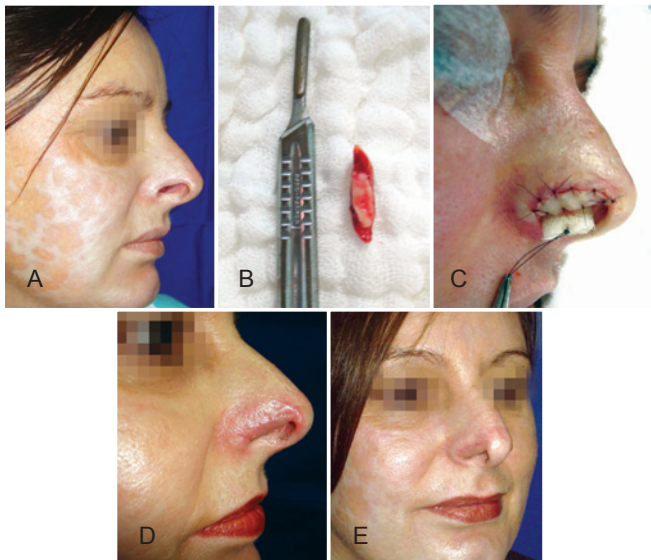
Figure 1 – Case 1. In A , preoperative appearance of a post-burn sequela. In B , composite skin and auricular cartilage graft. In C , intraoperative appearance. In D , appearance at 30 days after surgery. In E , appearance at 6 months after surgery.

A 23-year-old female patient was the victim of physical aggression consisting of a human bite. She presented with right nasal alar deformities, a 1 cm × 0.5 cm nasal alar defect and some alar cartilage imperfections (Figures 2A and 2B). The patient was a smoker.