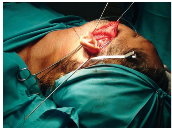
Figure 2 – Passage of wire through the retroauricular region with the wire mounted on the distal extremity.

The needle described here proved to be safe, could migrate easily through tissue, did not cause vascular or nerve