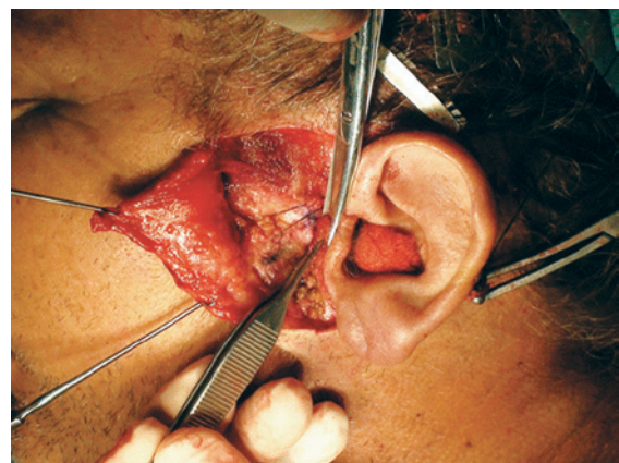
Figure 3 – Encircling of the muscular and aponeurotic structures without any dissection.