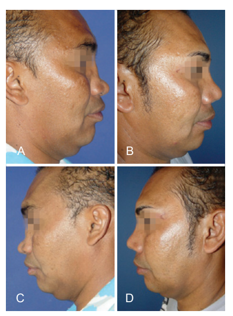
Figure 4 – In A and C, rhinoplasty preoperative aspect: right and left profile, respectively. In B and D, postoperative aspect 2 years after rhinoplasty: right and left profile, respectively.