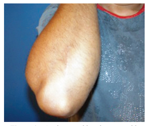
Figure 6 – Aesthetic and barely perceptible scar in the donor area.

is the auricular cartilage because it is proven to be flexible and resistant. In addition, a variety of different forms can be harvested and rendered available. Auricular cartilage is the first choice for the reconstruction of the external nasal valve because low donor site morbidity has been observed so far. Although the modeling of this graft is an advantage, it can be deformed easily as it is more fragile, less rigid, and less able to confer support than septal cartilage when it is damaged.