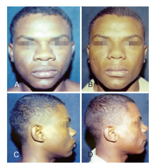
Figure 3 – In A and C, rhinoplasty preoperative aspect: frontal and right profile, respectively. In B and D, postoperative aspect 4 years after rhinoplasty: frontal and right profile, respectively.

According to the exams performed to monitor possible graft resorption (Figure 5), projection loss or signs of bone resorption did not occur up to 6 years after surgery. Secondary rhinoplasties were not necessary in this series of patients. Graft displacement or hypertrophic scars/synechiae did not occur and respiratory complaints were not reported.