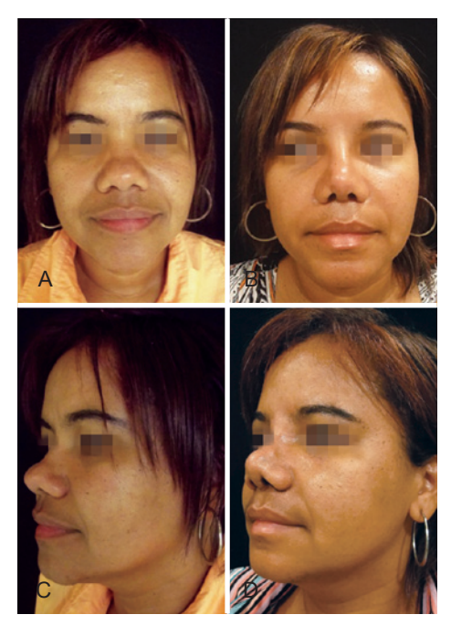
Figure 2 – In A and C, rhinoplasty preoperative aspect: frontal and left profile, respectively. In B and D, rhinoplasty postoperative aspect after micropore tape removal: frontal and left profile, respectively.

Open rhinoplasty was performed in 8 patients and the closed rhinoplasty procedure was used in 1 patient, the first of our series. The postoperative follow-up varied between 12 months and 6 years, with an average of 24 months.