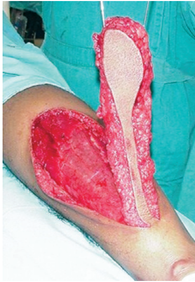
Figure 5 – Modifications to the technique. Dissection of the fasciosubcutaneous margin surrounding the skin of the flap improves circulation and leaving a lane of skin over the pedicle prevents the requirement for a skin graft.