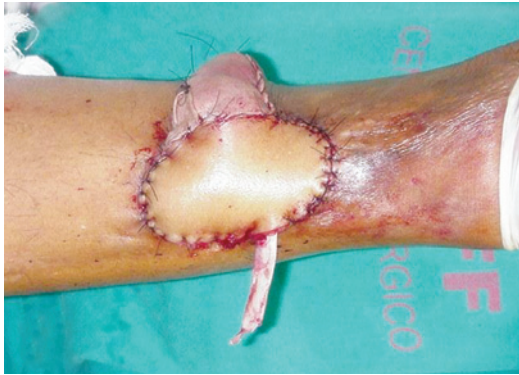
Figure 8 – Reverse flow sural flap in an island with the graft over the pedicle of the flap. This procedure was usually performed using the conventional technique.