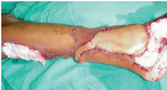
Figure 9 – Lane of skin over the pedicle. The flap technique was modified so that a lane of skin was left over the pedicle. This made the area firm and protected, thus avoiding both compression and the requirement for a skin graft.