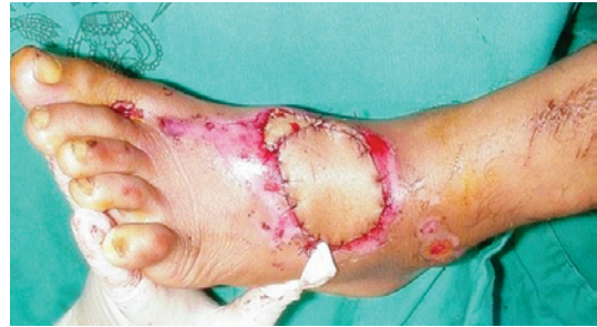
Figure 7 – A flap transposed through a subcutaneous tunnel. The flap can be transposed through a subcutaneous tunnel to avoid a scar between the rotation point and the wound. However, this technique has a high risk of compression of the pedicle due to edema and vascular congestion in the flap. In these cases, the lane of skin is not left in the pedicle.

In total, 52 fasciocutaneous and 9 fasciosubcutaneous graft surgeries were performed. The treated areas were the foot (17 cases: 10 in the heel and 7 in the dorsum) and the distal third of the leg (44 cases: 9 anterior, 21 anteromedial, 5 anterolateral, 6 medial, and 2 lateral).