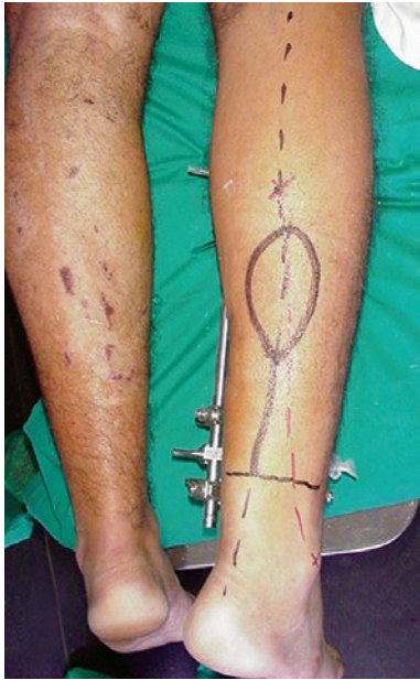
Figure 1 – Marking the graft. The rotation point is 5 cm above the lateral malleolus (the limit for dissection of the pedicle). The length of the pedicle is identical to the distance between the rotation point of the flap and the wound. The size of the flap is identical to the size of the wound.