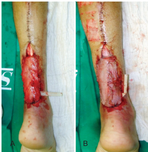
Figure 6 – The fasciosubcutaneous flap. A , in wounds in the heel or over the lower Achilles tendon, the best option is to generate a fasciosubcutaneous flap by folding it over its rotation point, like a book sheet. The fascial side, which is the side that receives the skin graft, should be facing upwards. In these cases, the skin of the flap and the pedicle should be removed. B , the flap after the skin graft.

In total, 52 fasciocutaneous and 9 fasciosubcutaneous graft surgeries were performed. The treated areas were the foot (17 cases: 10 in the heel and 7 in the dorsum) and the distal third of the leg (44 cases: 9 anterior, 21 anteromedial, 5 anterolateral, 6 medial, and 2 lateral).