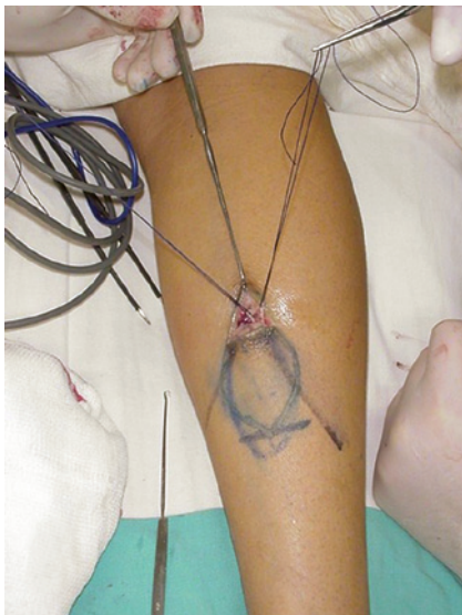
Figure 2 – Beginning the flap dissection. The dissection begins in the upper margin, in a beveled and ascending manner, in order to generate a fasciosubcutaneous margin beside the cutaneous margin of the flap.

over itself (like a book sheet) or through a subcutaneous tunnel, it was necessary to remove the piece of the skin of the pedicle (Figures 6 and 7). Esmarch bandages and pneumatic